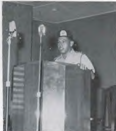
Lieutenant Aeria of the Traffic Dept., Singapore Police, addressing students in chapel.

ground were attached to car bumpers, telling the people of Singapore that "Safety Demands Sober Drivers."