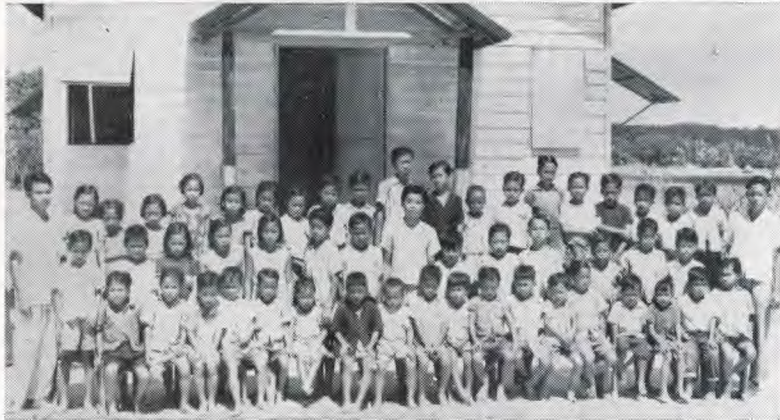
Students stand in front of their newly remodeled school in Kelawat, Kota Belud, North Borneo.