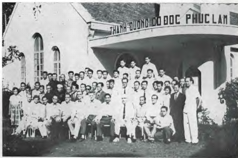
Delegates attending Vietnam Mission Biennial Session