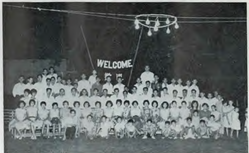
The Pathfinders of the Kuala Lumpur Chinese Church during a recent social gathering at Teh Sin School.