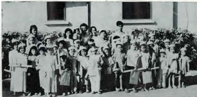
Thirty two pupils from the first Vacation Bible School of Vietnam received their awards at the school closing exercise held at Phu-Nhuan SDA church.

push through with this soul-winning agency to a larger extent. Materials are now being prepared in the Sabbath School Department of Vietnam to introduce and implement the holding of Vacation Bible Schools throughout the field.