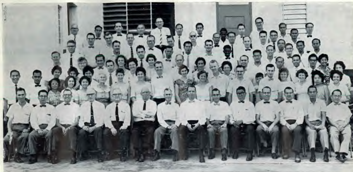
Pictured above are the delegates and those in attendance of the Biennial Session held in Singapore January 17-22, 1962.

The motto chosen for the 12th Biennial Session of the Union of Southeast Asia was not chosen lightly. While the sign itself is high above our heads, yet it is easily within our reach. Listen to this quotation from the Spirit of Prophecy: