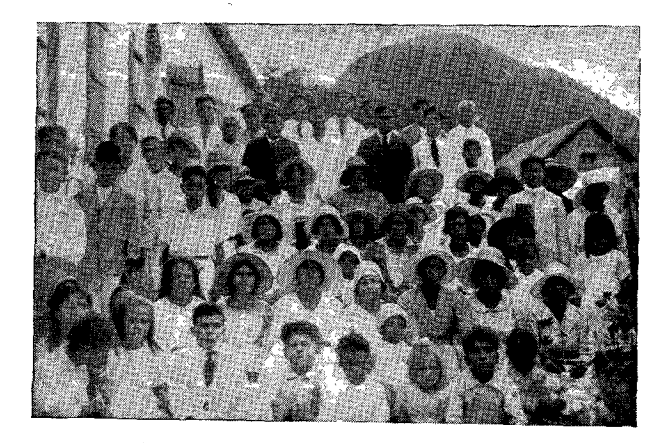
Believers and friends, Seychelles Islands

Early Sabbath morning, the baptismal candidates, the church members, many friends as well as a large host of curious onlookers, gathered at a place called Union Vale. After a stirring sermon by Elder Girou, 27 souls were burried with their Lord in baptism to be raised again and to walk in the newness of life. After the baptismal service we proceeded to the church where we partook of the emblems of the bruised body and the spilt blood of our Lord.