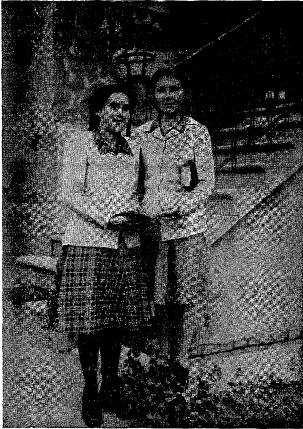
Two girls, 15 and 17 years of age, who have raised up a church in Hungary.