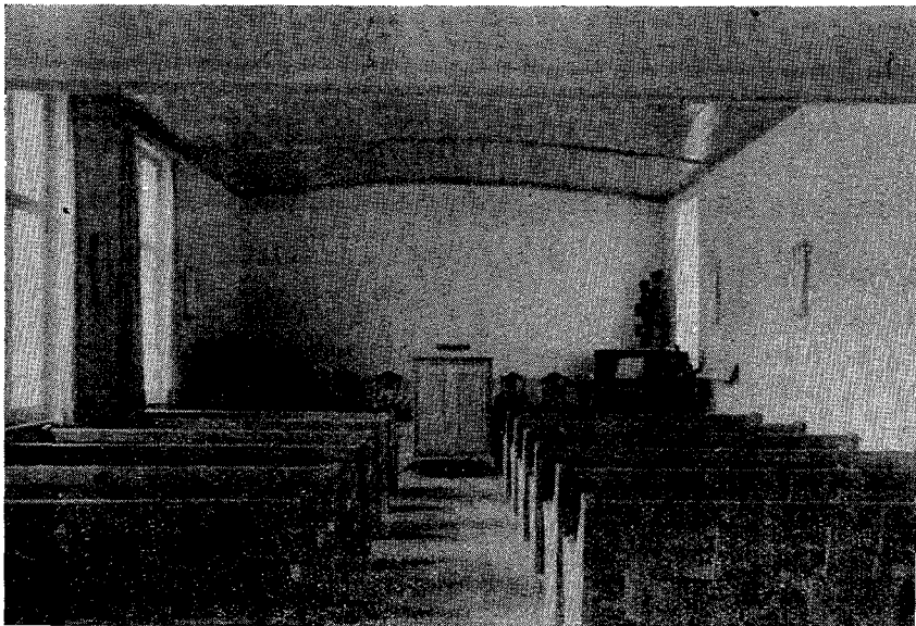
Interior of Reigoldswil (Switzerland) chapel, dedicated September 23, 1950.

One of the outstanding events to take place in the Southern European Division will be the European Youth's Congress to be held in Paris July 24-29. More than three thousand young people from Central, Northern and Southern Europe, as well as a delegation from the United States and perhaps also one from Australia, are expected to attend this gathering. Preceding the Youth's Congress, the Southern European Division will hold a Division evangelistic worker's meeting in Paris, the exact date to be set later. More information about these events will appear in our next issue.