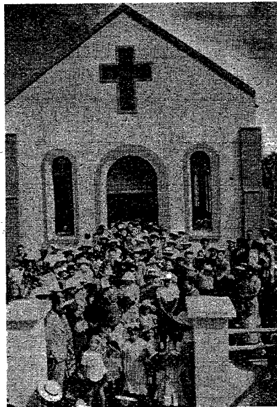
Church at Ravine des Cabris, Reunion

coined expressions well-known to the missionaries of Reunion, but which I shall not take the