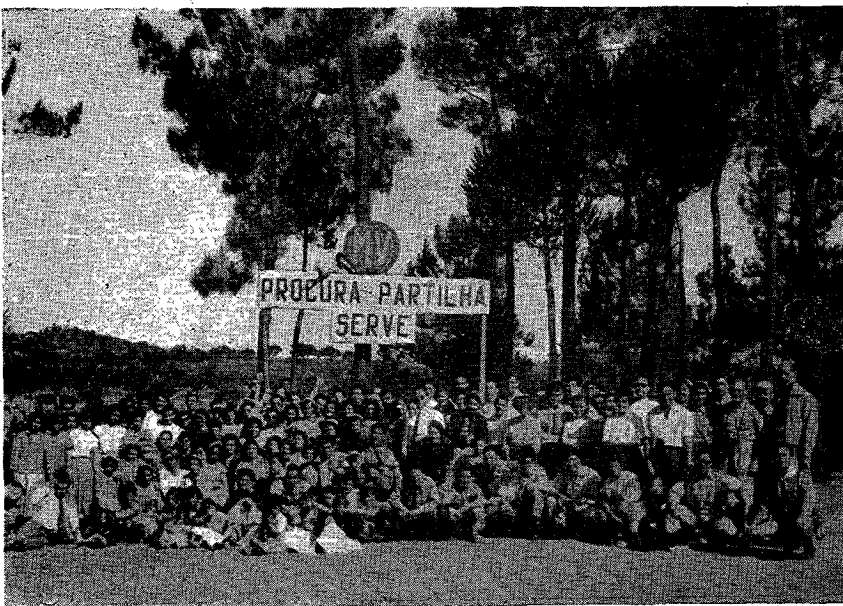
Portuguese Youth Congress