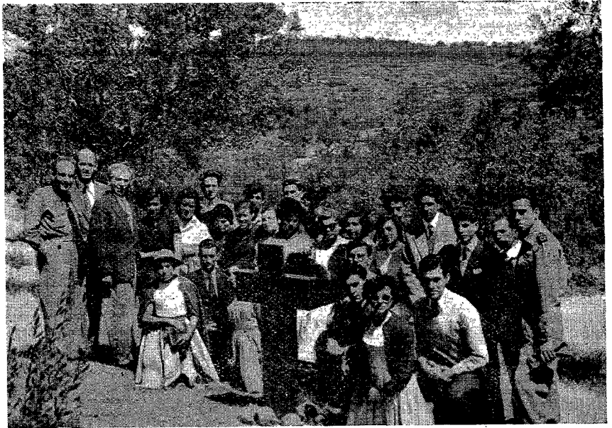
Youth Congress Portugal Young, people desiring baptism

While small in comparison to other congresses in the world, this Portuguese camp congress is the largest of its kind we have ever had, and we believe God's blessing will complete the efforts to encourage youth once more to rise up and finish the task, because we know time is short. May God direct these splendid young people to find their place in the Master's service.