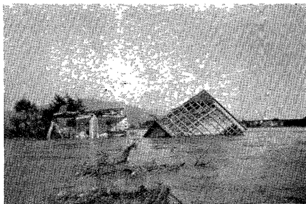
Flooded area Linz on the Danube

Night fell, — the time of rest for weary toilers, — but many of the inhabitants of Linz dared not close their eyes. They were haunted by the vision of the frantic waters of the Danube that had long since overflowed its banks. The dirty, brown tide rose higher and higher in the streets of the adjacent suburbs, flooding cellars and yards. And with the swift rising current, the anguish and terror in the hearts of the people arose also. The water came rushing in around our brother's house, and close by hundreds of other houses were already partially submerged. Cries for help from those in danger rang out on the night air. Man and beast were in danger of death. Possessions that had been accu-