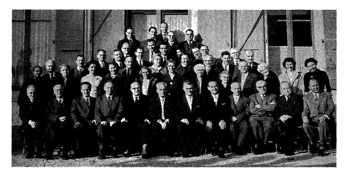
Delegates to the Division Annual Meeting, Gland, 1959

Looking at the force of workers employed within the Division we find that there are 1,933 on the payroll, and adding to them the 196 book evangelists, there are altogether 2,129 men and women engaged in spreading the good news of Christ's Second Coming.