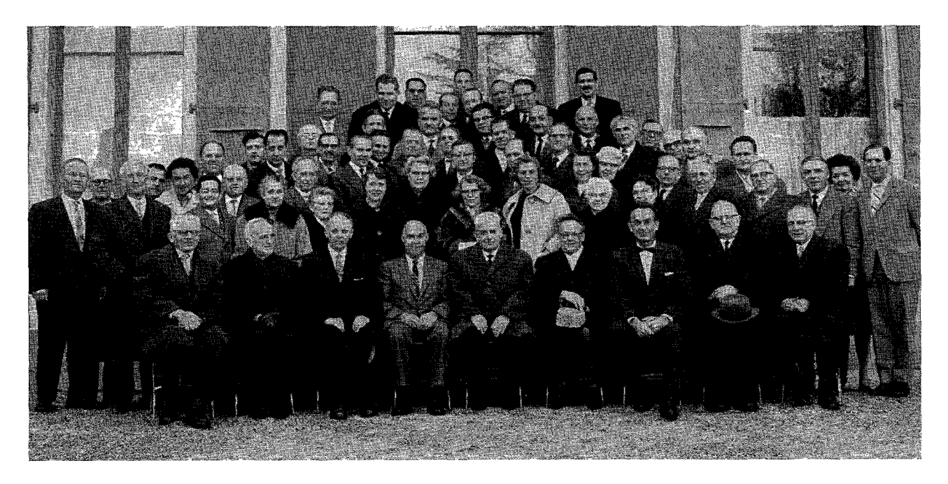
Delegates to the Division Council 1960

The Division membership at the end of the third quarter 1960 stood at 107 716, and the baptisms of the fourth quarter will be more than enough to pass the goal of 8800 for 1960. The Southern European Council closed on the strong central theme of «Christ to the World» by means of a well-planned program of evangelism and a renewal of dedication to this great task on the part of all the delegates.