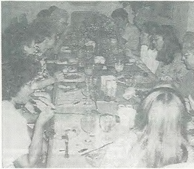
Pastoral wives in Houston enjoy their own prayer breakfast.