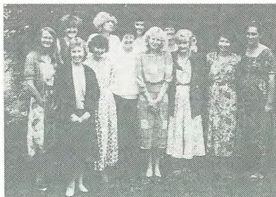
Pastoral wives at Tui Ridge in New Zealand

✿ Nearly a dozen pastoral wives from the two New Zealand Conferences met together for four days at the Tui Ridge camp near Rotorua on the North Island. Fellowship and discussions on raising children in the pastoral home