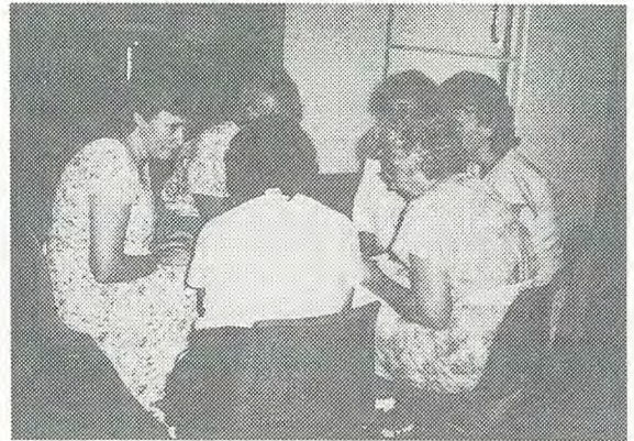
Discussion groups meet at Yarrahappane.

✿ Over 50 pastoral wives, from the Trans-Tasman Union, came together for fellowship at the Yarrahappanne church camp on the beautiful shores of the Pacific Ocean in Australia. A report on what Shepherdess International is doing worldwide was presented. The women appreciated time for fellowship and discussion on the benefits and