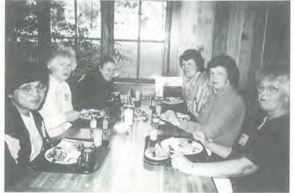
Oregon Conference pastoral wives at Silver Falls.

❖ Oregon Conference —The pastoral wives of the Oregon Conference enjoyed fellowship and renewal at their annual retreat held at Silver Falls.