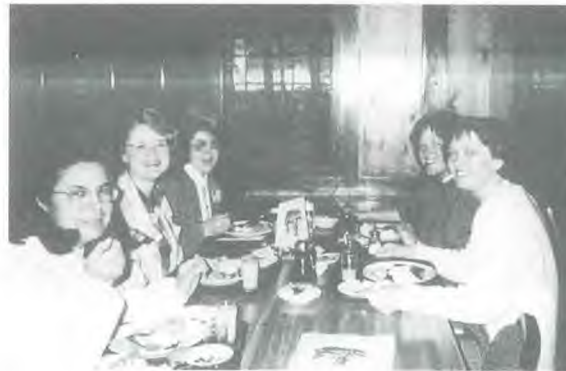
Oregon pastoral wives enjoy fellowship.