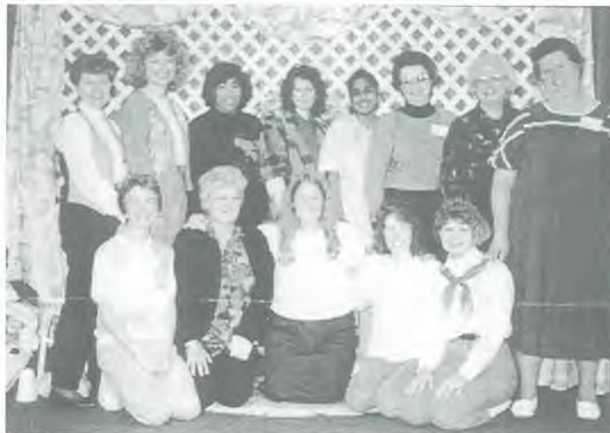
Northern California Conference Pastoral Wives Officers