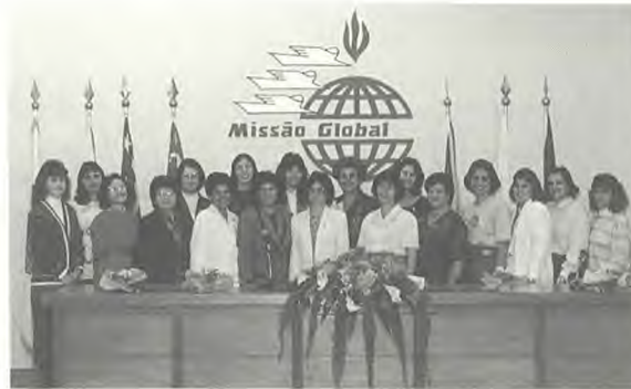
Central Union, Brazil Shepherdess Coordinators.