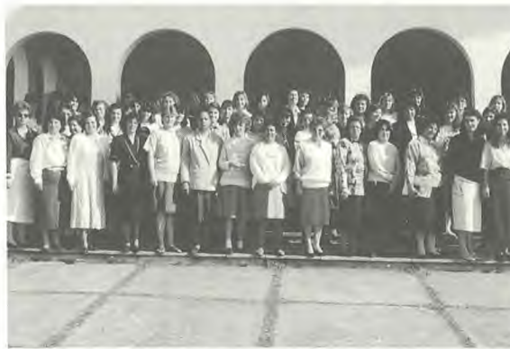
Pastoral wives who attended the Shepherdess meeting in the Sao Paulo Conference, Brazil.

reported that 23 pastoral wives of ordained ministers from the South Tamil Section came together for three days of meetings in Madurai.