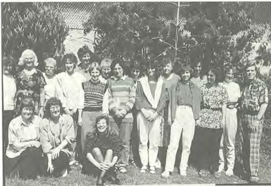
Pastoral wives from the Swiss-German Union