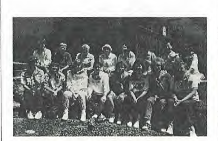
German Swiss Conference ministers' wives in Bernese Oberland

A cheerful group of ministers' wives from the German Swiss Conference met together for three days in June in the beautiful mountains of Bernese Oberland. The presentations, discussions, songs, and prayers centered on the subject of "peace." Interruptions with gymnastics, theoretically and practically, made it easy to concentrate. On one evening the women had the special experience of coloring silk-scarfs. They all were thrilled by the beautiful results.