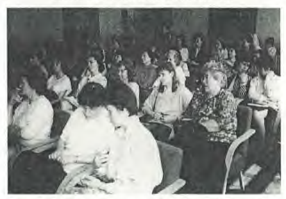
Czech Union pastors' wives listen to their seminars.