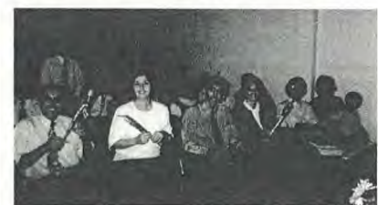
Pastors and wives meet together for a seminar in Manaus, Brazil, commemorating the "Day of the Pastor." The conference provided flowers and gifts for all and dinner at a fine restaurant.

Two meetings were held for the theology students' spouses: in Peru, at the Inca Union University and at the Theological Seminary in IAENE in Brazil. Both meetings included seminars on the importance of continuing education.