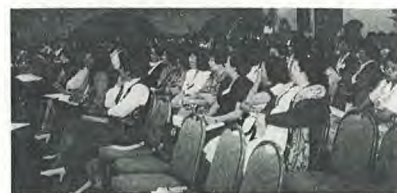
Administrative wives at their meetings in Costa Rica.