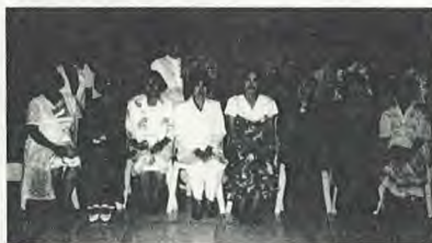
Pastors' wives from the East Visayan Mission pose after a surprise party they planned for their husbands at a prestigious restaurant.