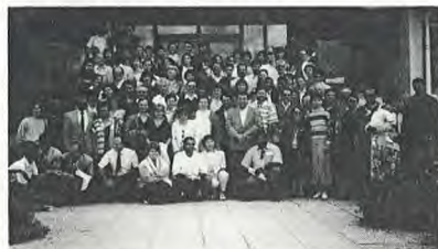
Shepherdesses and sponsors from the Franco-Belgium Union Conference at their annual retreat.