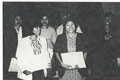
West Java Mission pastors' wives receive certificates from the Adventist University in Bandung which certifies them Bible workers.