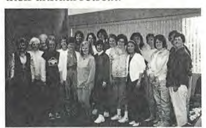
Idaho Conference ministry wives at their annual retreat.

The Idaho Conference ministry wives met in Boise for their annual retreat.