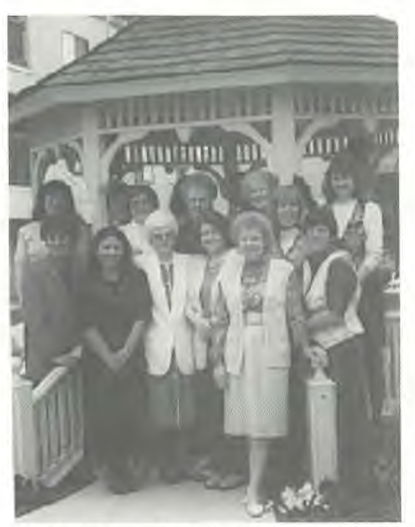
The ladies who enjoyed the weekend of fellowship at the Idaho retreat.