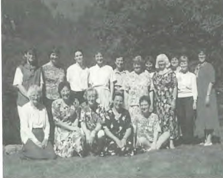
Ministers' wives in Bernese, Switzerland meet together in a lovely setting.

About 100 pastors and wives from the Czecho-Slovakian