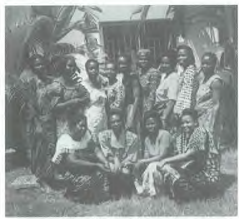
Cote d' Ivoire Shepherdess

The Cote d' Ivoire Shepherdess Chapter, Sahel Union, met together and had discussions on the topics of "Communication in Marriage," "Spirituality in Marriage," "Sexuality in Marriage," and "Finances in Marriage." The meting ended with a demonstration of how to make communion bread and a Consecration Service.