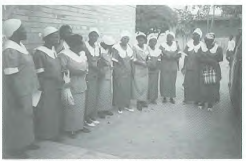
The East Congo Union Mission Shepherdesses meet together.

The Liberia Mission Chapter as a membership of 13. They recently held a retreat which featured the theme "Preparing the Shepherdess for Effective Ministry."