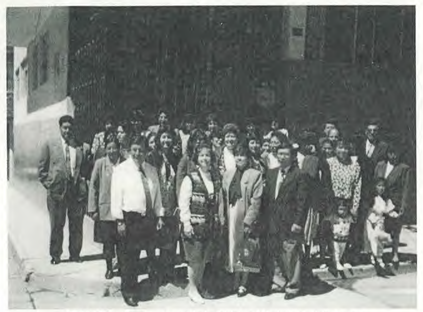
AFAM (Shepherdesses) and Lake Titicaca Mission administrators in front of the Mission office building.