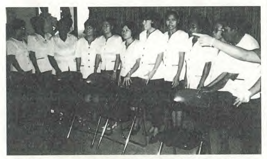
The Shepherdess group from Irian Jaya during the Shepherdess meetings in Indonesia.