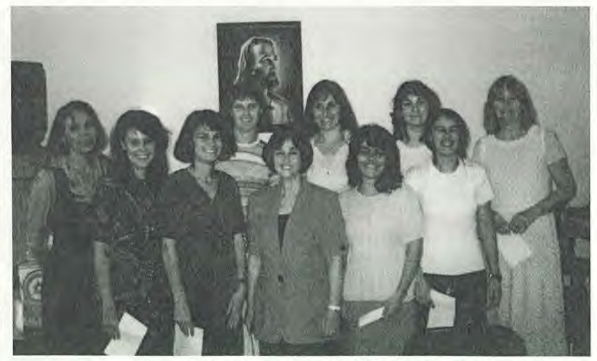
Pastoral wives from S. Catarina Mission in Brazil meet for a special day to honor their pastor/husbands.