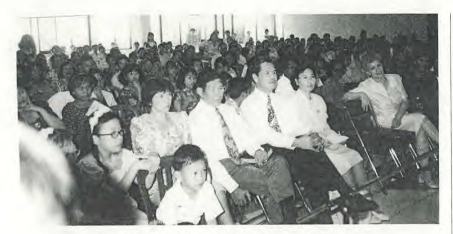
Attendance at the Manado, Indonesia evangelistic meetings