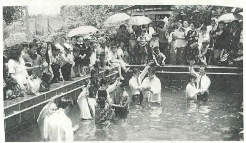
Baptism at the Union office in East Indonesia

Shepherdess Seminars were held in the mornings for all the pastors wives