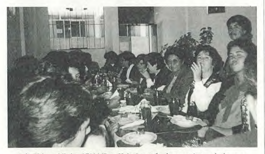
Lake Titicaca Mission AFAM (Peru Union) meet for three meetings and a banquet.