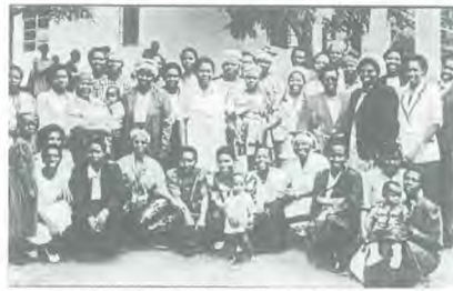
South Mwanza Conference Shepherdesses.