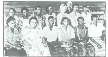
Bugema Shepherdess Chapter, Uganda Union.

the sick. Since funding for these meetings is so very limited, the Shepherdesses raise their own funds through bee-keeping, operating guest hostels and establishing a food factory.