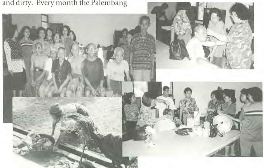
Shepherdesses of South Sumatera and the elderly they serve.

The Palembang Chapter Shepherdesses also conduct cooking classes followed by evangelistic crusades. This year they have baptized 141 precious souls. Praise the Lord!