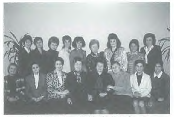
West Russia Union Shepherdess Coordinators