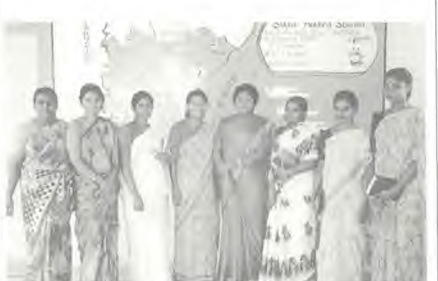
Pastors wives who are newly trained Bible Women from South Andhra Section.

were new pastoral wives and received the needed training to join the stream. Six projects have been undertaken by these women and they are engaged giving Bible studies, organizing prayer groups, visiting homes and hospitals,