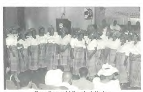
East Central Nigeria Mission Shepherdess Choir

women. Special time for individual conversations with the women made for a good time together.