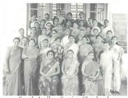
South Andhra Section Shepherdess Meeting participants.

were new pastoral wives and received the needed training to join the stream. Six projects have been undertaken by these women and they are engaged giving Bible studies, organizing prayer groups, visiting homes and hospitals,