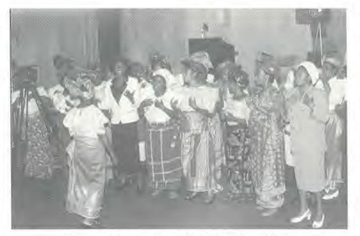
Rivers Conference Shepherdess Choir