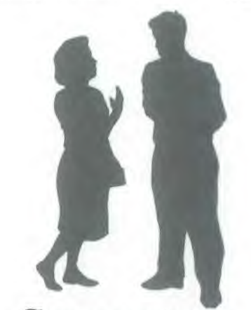
True communication leads to happier lives.

True communication enriches a couple's lives and makes for a happier home. Men and women need to understand the other's communication style and endeavor to incorporate both styles into their lives. It is an art to be practiced everyday. True communication leads to happier lives.