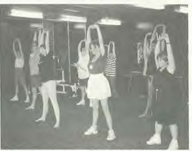
Exercise classes at the Czechoslovakian Union Healthy Lifestyle Meetings