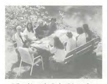
Fellowship at the Baden-Wurttenberg Conference Shepherdess Retreat