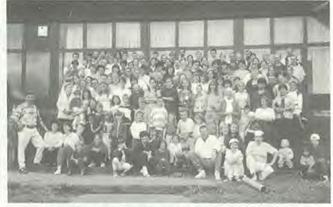
Slovakian ministry wives and husbands at the Lifestyle Retreat