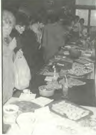
Delicious, nutritious food at the Czechoslovakian Union Healthy Lifestyle Meetings