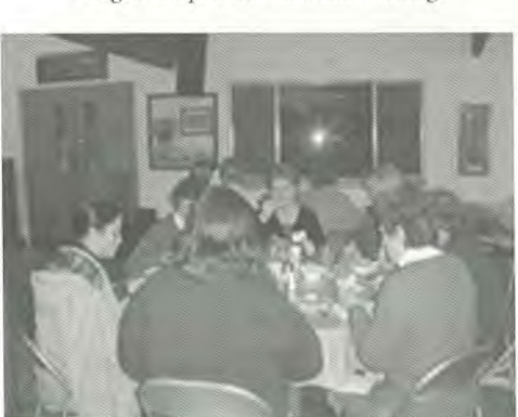
Food and fellowship were the key words for a good time!