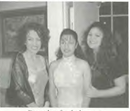
Dressed up for the banquet.