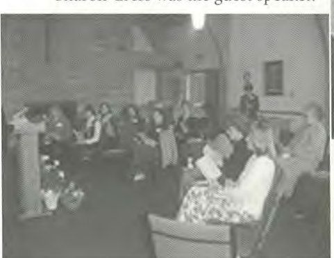
Singing and praise and testimonies at the Oregon Shepherdess annual meeting.