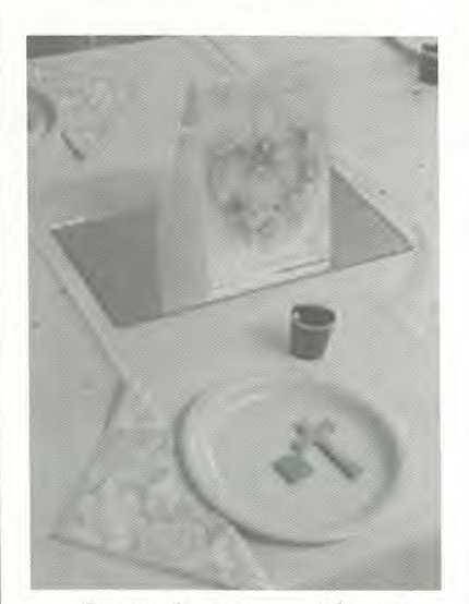
Communion was a special event for the women.