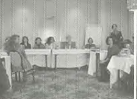
Panel discussion and questions and answers at the Texico Shepherdess meetings.