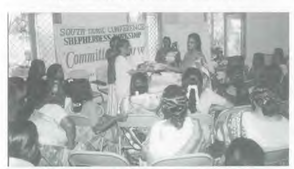
Distribution of gifts and evangelism manuals