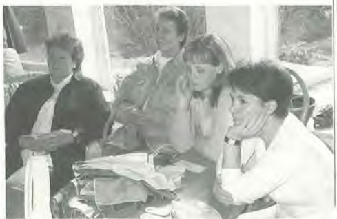
A seminar on color coordination at Hansa Conference