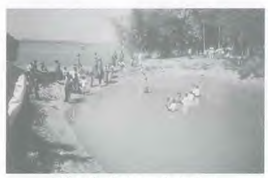
Jalchatra Shepherdess meeting baptisms in the North Bangladesh Mission