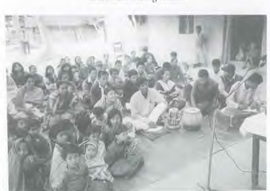
The South Bangladesh Mission meeting attendees