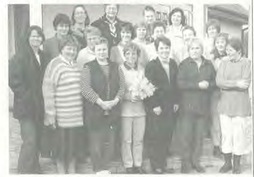
Pastors' wives from Hansa Conference of the North German Union at their annual retreat