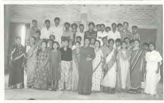
West Bangladesh Missions Shepherdess with baptism candidates