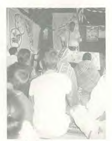
Daniel and Revelation Seminar at the Erukkancherry Church