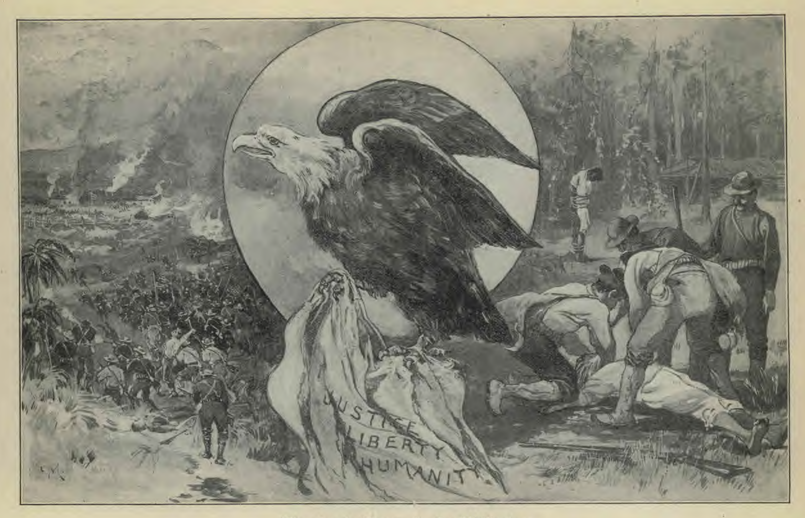
The Anglo-Saxon in the Philippines

Under the influence of the evil genius of empire America is re-enacting in the Philippines the policy which a few years ago in Cuba caused the hearts of the American people to