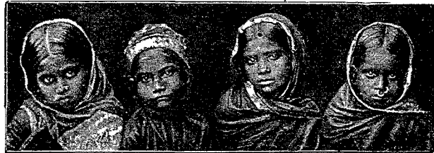
Little Girls of India.

Fancy such a child married to a man forty or fifty years old who has neither love nor compassion in his heart for her, and who deliberately tortures her to such an extent that in order to escape him she takes her own life by drowning herself in the nearest tank, or by swallowing a dose of opium! Such instances are not uncommon in India. There is no slavery on the earth that can be compared to the slavery inflicted on the little girls of India. Those who know the heart of a mother