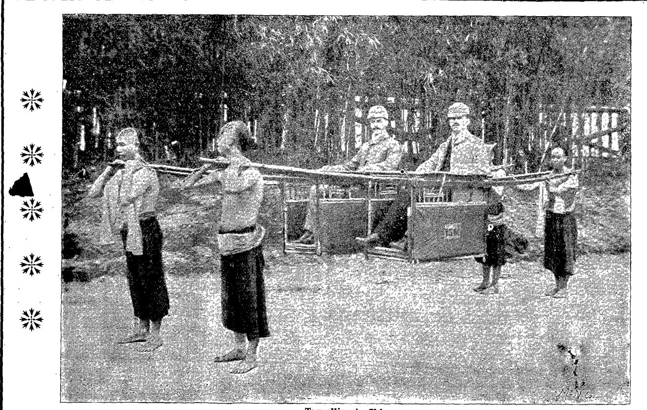
Travelling in China.

We hear a good deal about the dead rejoicing in the presence of