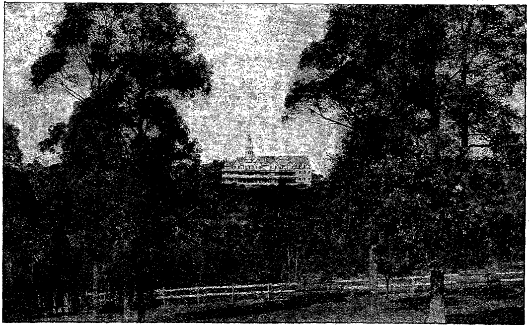
A Distant View of the Sydney Sanitarium.

Since coming to Africa to assist in the work of enlightening and uplifting this people, I have wondered who of the many would receive the gospel message preached to them from the word of God. I am satisfied that the Spirit of God is now working upon hearts and opening deaf ears and blinded eyes; the seed sown is making impression in their lives for good.