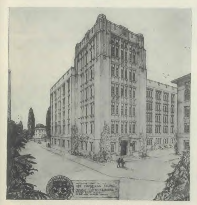
New Engineering Building of McGill University, Montreal