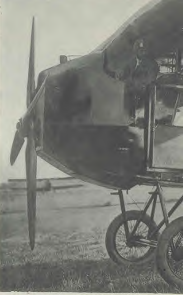
The First Airplane of the New Bolshevist A