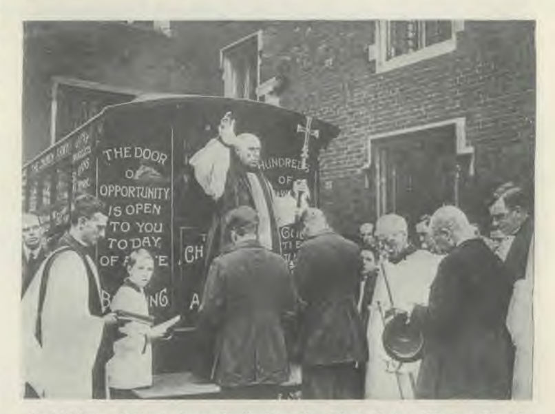
Archbishop of Canterbury Dedicating the First Motor Mission Church

"Could not short-time tithing be tried out here and there just to show the people what it would mean to the church? There exists in many minds the impression that the offerings of the church are really liberal, and an experiment of this kind, wisely conducted, may be a genuine revelation. In this case, assuming that the pastor was right in his assumption that the rest of the 875 members had an income five times as great as the 142 who tithed, it would mean that the weekly income of those church members was about $40,000, and out of this they contributed regularly about $175 for ordinary church purposes, or less than one half of 1 per cent. Or looking at it from another point of view, these 875 members paid regularly to the church just twenty cents per capita every week, or a little less than three cents a day. It is probable that if we counted special offerings and included all the different local and connexional givings, the average would be considerably increased, but the fact remains that in very many cases, our contributions to the church of God bear no relation at all to our prosperity or our assured income. In most cases, our religious giving has never been put on a really business basis. This should not be. The church has a right to better at our hands. What would a week's tithe show in your church?"