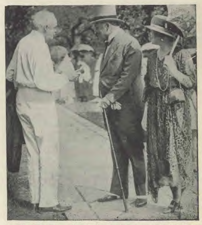
Lord Balfour on a Tennis Court Conversing with Sir Hamer and Lady Greenwood