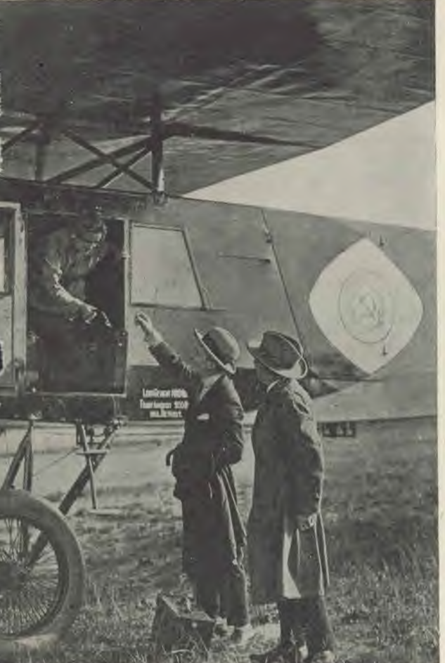
ir Line from Moscow to Konigsberg, Germany