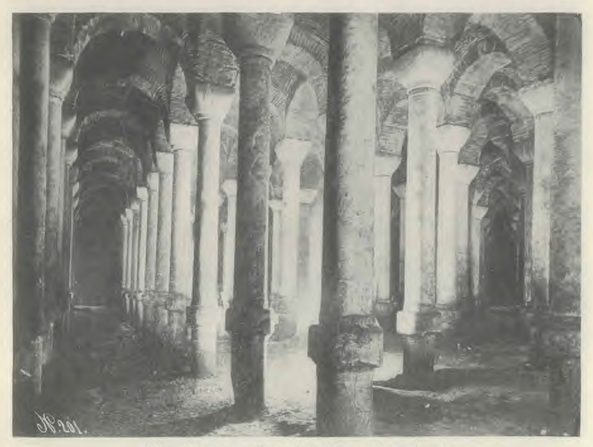
Hall of the Thousand and One Columns, Constantinople

We ask, Could there possibly be a more plain