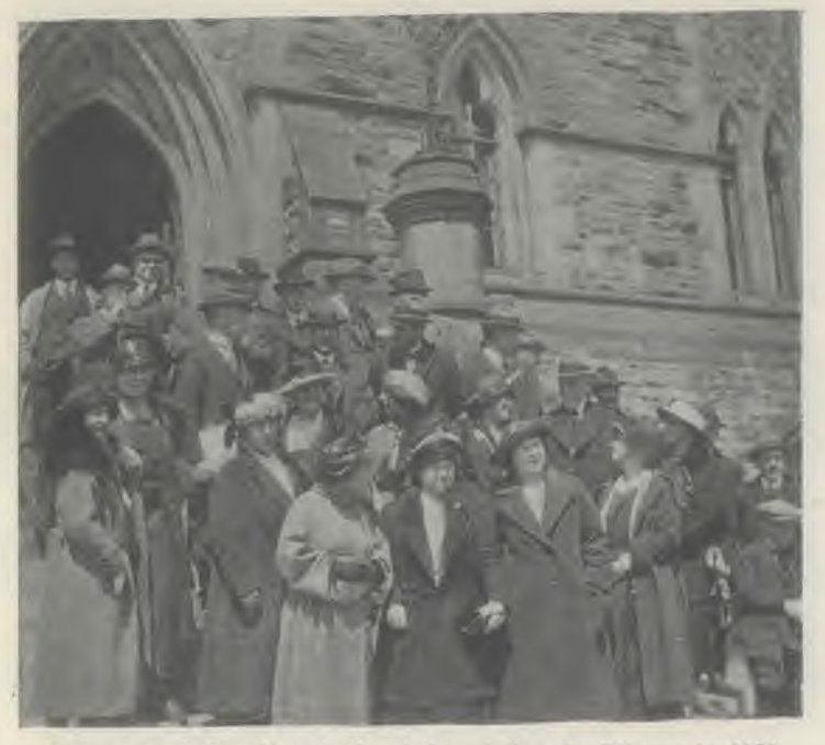
Delegates of Canadian Authors' Association, in Ottawa, in 1922