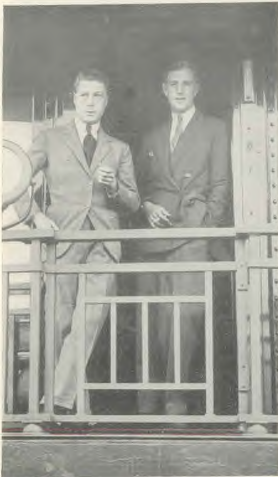
His Royal Highness and Lord Mountbatten on the rear of the Prince's observation car en route to the royal ranch at High River, Alberta.

Following these simple rules will help build up a life of health and usefulness and will give happiness and length of days.