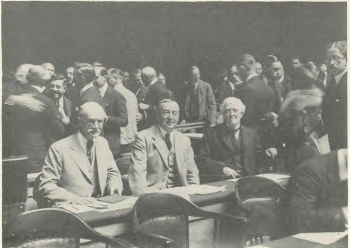
BRITISH DELEGATION AT LEAGUE OF NATIONS ASSEMBLY, GENEVA

But in order that we may be absolutely without any grounds for doubting these saving truths, the Bible tells us how we are to verify them. "Faith cometh by hearing, and hearing by the Word of God" (Rom. 10:17), "Wherefore lay apart all filthiness and superfluity of naughtiness, and receive with meekness the engrafted word, which is able to save your souls." James 1:21. "And whomsoever among you feareth God, to you is the word of this salvation sent." Acts 13:26. "Beware