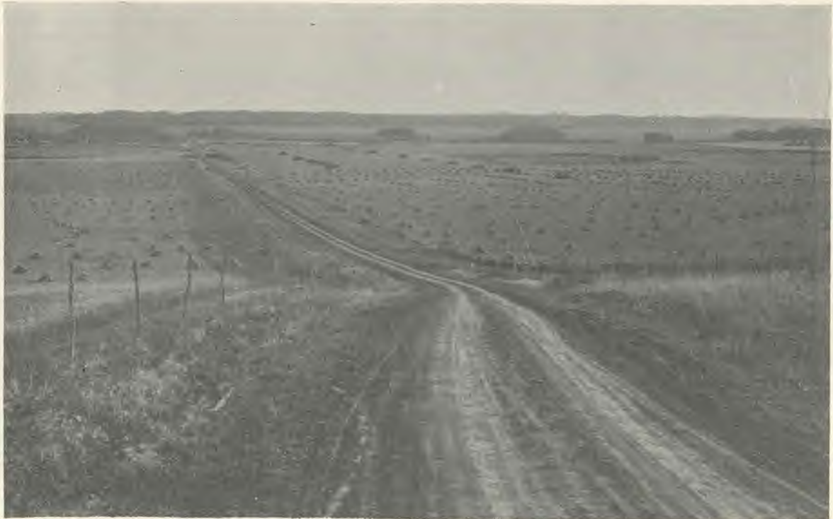
Harvest time in Sturgeon Valley, near Edmonton, Alberta

We cannot hold to the divine Christ of the Bible, the Saviour of men, and throw away the Bible, or any part of it. One has truthfully said, "The crisis is now upon us. The battle is to be waged between the Christianity of the Bible and the Christianity of human tradition." Again the same author says, "Human science is too limited to comprehend the atonement. The plan of redemption is so far-reaching that philosophy cannot explain it. It will ever remain a mystery that the most profound reasoning cannot fathom. The science of salvation cannot be explained; but it can be known by experience. " We can believe the word and experience its saving power.