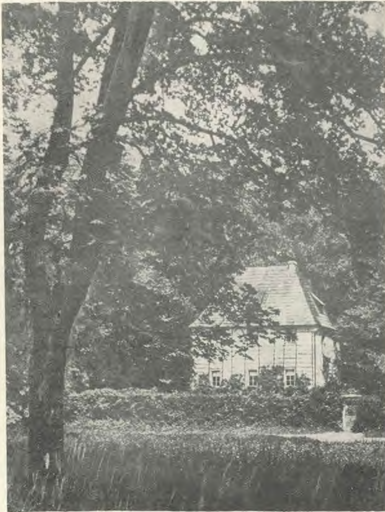
Goethe's Summer House at Weimar. This photograph from "Picturesque Germany," published by Brentano's.