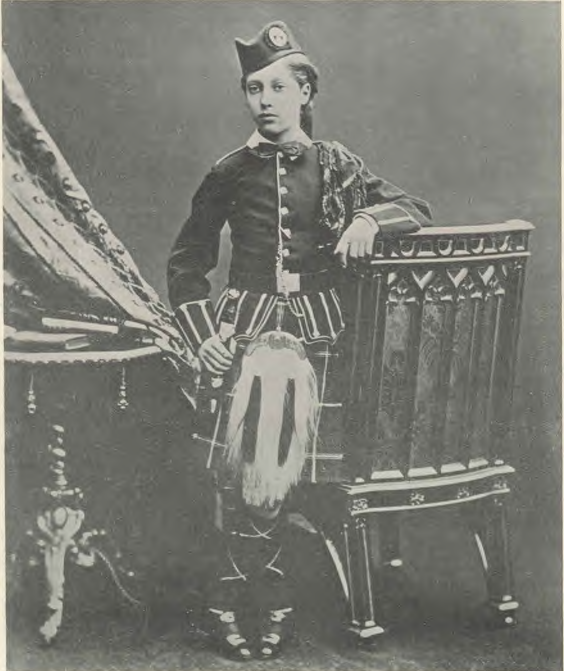
A Photograph of His Majesty King George V at the age of ten years. Notice the striking resemblance between King George at that age and his daughter, Princess Mary.