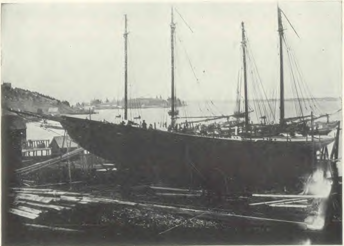
Ship-building is an important Canadian industry in Ontario, British Columbia and the Maritime Provinces.

goodly number of miles with nothing in its appearance to indicate that soon, so to speak, it is going to sow some wild oats. It is when it reaches the Maligne Canyon, situated about five miles from Jasper Park Lodge, that it begins its pranks. Here it dips suddenly, and without warning, nose dives into a narrow gorge it has cut for itself out of solid rock. Within a distance of fifty yards this chasm reaches a depth of several hundred feet and it is hard to see the water which has lessened in volume. This diminution continues until only a trickle is left. Yet before the Athabaska is reached, the river is again a roaring torrent. Only one explanation seems possible, that somewhere the river loses itself in an underground passage. The canyon is one of the many interesting spots for those who visit this magnificent playground in the Canadian Rockies every year. Jasper National Park is reached by the Canadian National Railways.— Selected.