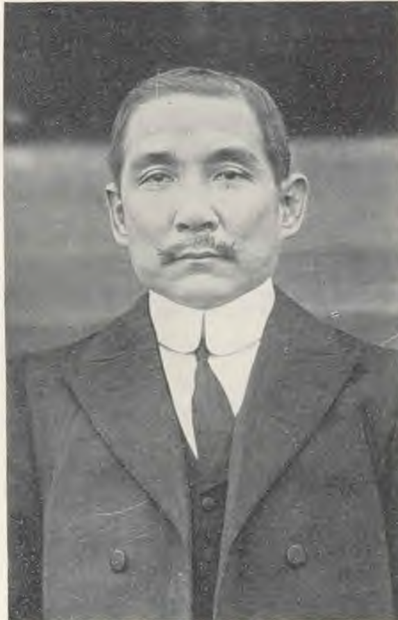
THE LATE SUN YAT SEN OF CHINA

There are newspapers which play up the rottenness their reporters can find, and display it to all the world. These papers dig down into the moral corruption of their cities, they feature the vile, the low, the degraded; they emphasize divorce and conjugal infidelity. And the fact that the most sensational papers have the largest circulations in many cities is an indication that there is something in the hearts of