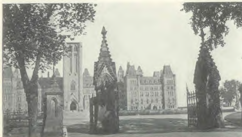
6. The royal mint and archives.