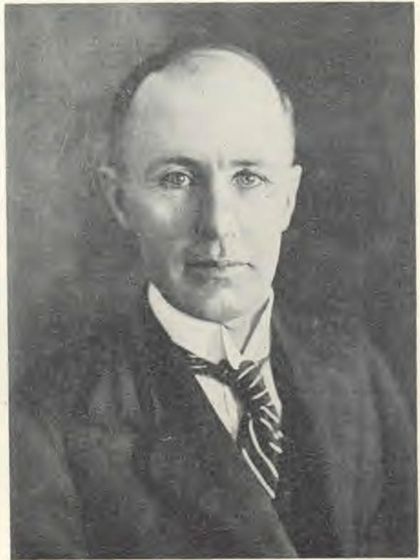
HON. ARTHUR MEIGHEN Leader of the Loyal Opposition

pathetic help of the British government, Confederation became an accomplished fact, and many of the problems that almost dismayed the pioneers have been solved. Understanding and fellowship have gradually taken the place of distrust and fear in Quebec and Ontario. Now the railway communication from the Atlantic to the Pacific, from Halifax to Vancouver, is unexcelled. Prosperous and growing provinces are taking the place of the empty waste spaces in the west, and our mineral wealth is just beginning to be tapped. We still have problems, different from those already overcome, but no more formidable and the knowledge of what has been done should give all Canadians courage to work together hopefully. Our present problems can be successfully met by increase of population and the development of our great natural resources.