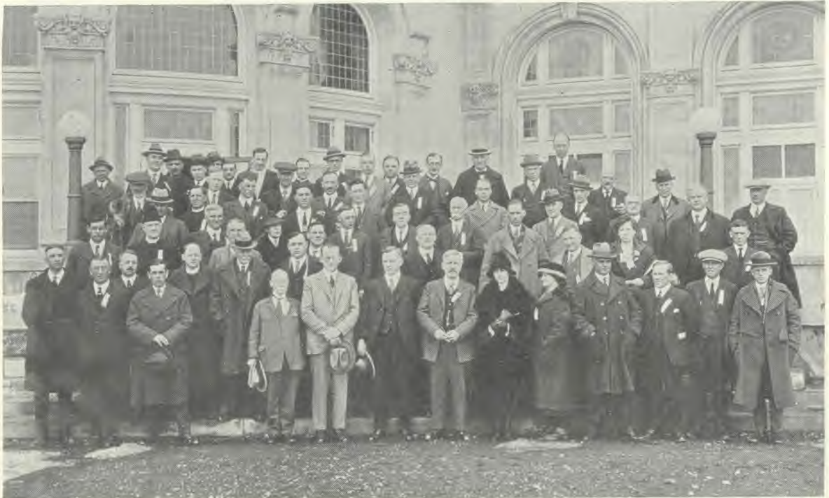
Delegates from Central and Northern Alberta to Immigration Conference in Edmonton, March 9, 1925

In the past the peoples of earth have, to a greater or less extent, feared the Lord. They have not been altogether atheistic. The denunciations of His messengers have caused them to tremble. Even wicked Felix trembled as Paul