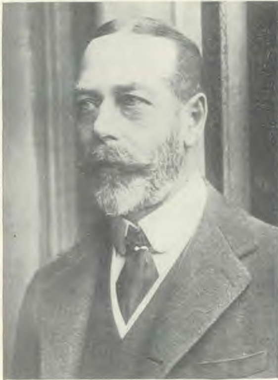
HIS MAJESTY GEORGE V God Save the King