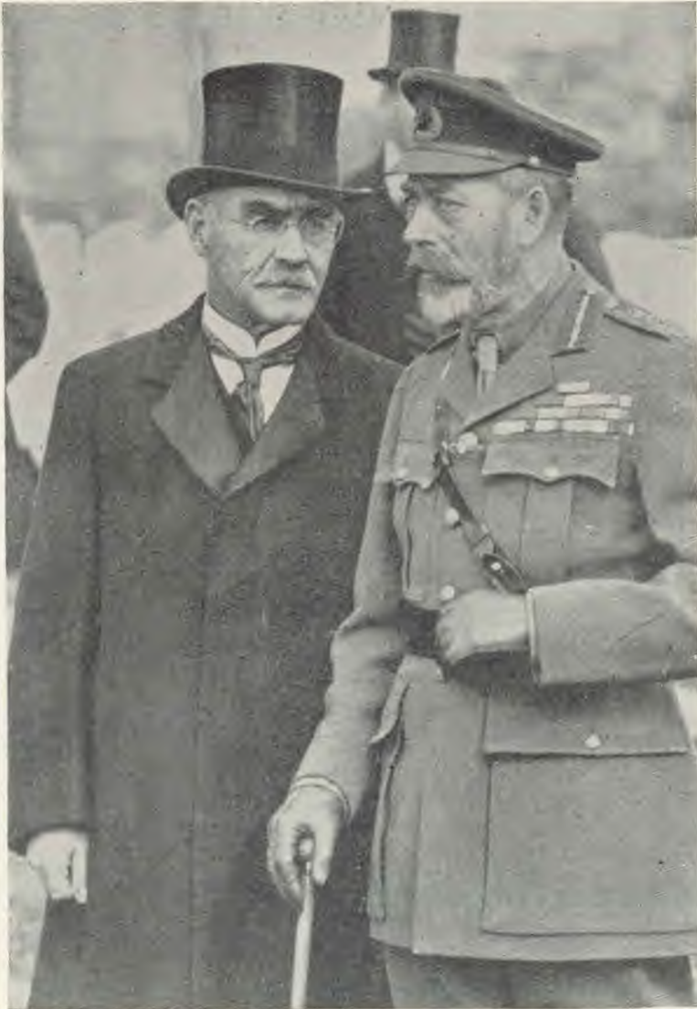
His Majesty King George Having a Friendly Chat with Rudyard Kipling.

Deut. 4:5, 6. Had the people of Israel fallen in love with these statutes and cheerfully made the reforms called for, they would have exerted a saving influence upon the people, but the light was kept under a bushel. The salt had lost its preserving property and was good for nothing but to be cast out and trodden under foot. All this has been placed on record for our learning and admonition. Not until the church does her appointed work can the end come. But there is to be no repetition of past experiences, for the prediction made by the Lord "my people shall be willing in the day of my power," will meet its fulfilment, and this gospel of the kingdom shall be preached in all the world as a witness unto all nations, and then , the Saviour said, "Shall the end come". "The time of the end" is here. Soon the work of God on the earth will be finished. It will be accomplished by agencies seen and unseen. The work will be finished and "cut short in righteousness." "The words are closed up and sealed till the time of the end," and at that time "Many shall be purified, and made white, and tried; but the wicked shall do wickedly: and none of the wicked shall understand; but the wise shall understand." Dan. 12:9, 10.