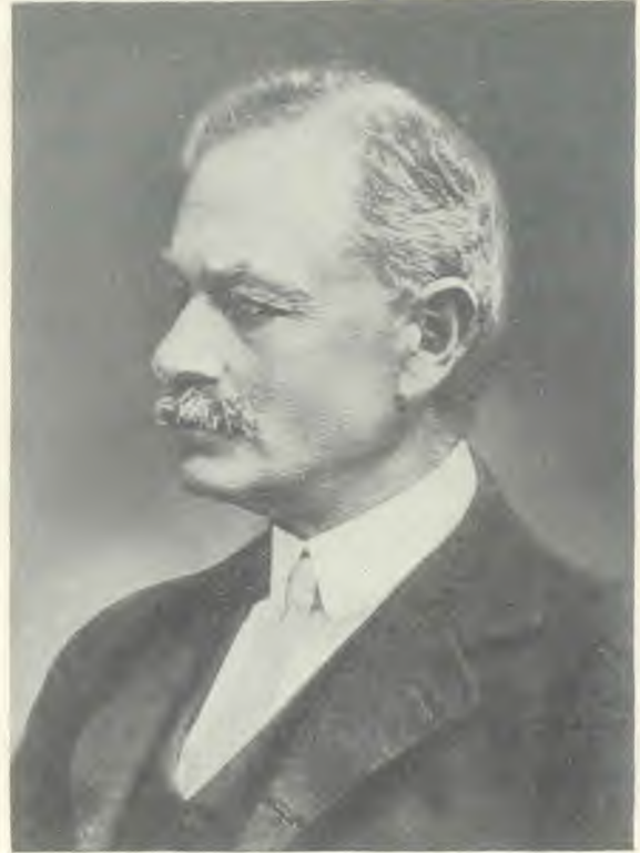
HIS EXCELLENCY LORD BYNG He Represents the King in Canada

days, whether individual or national are, however, proper seasons for sober reflection. Confederation Day stands for a victory for peace, reason, and patience that has for more than one hundred years characterized our relationship with our neighbours and kindred in the United States, and our co-operation with the mother country.