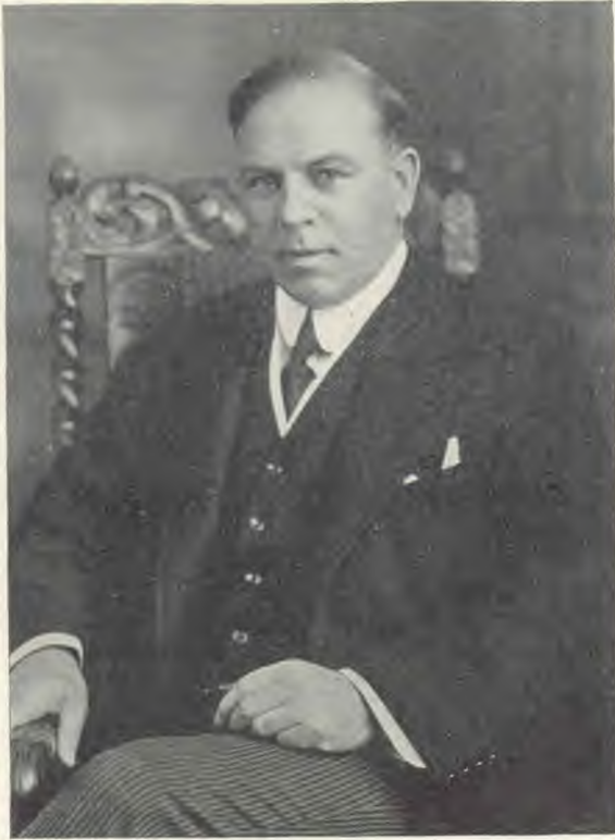
HON. WM. LYON MACKENZIE KING Prime Minister of Canada