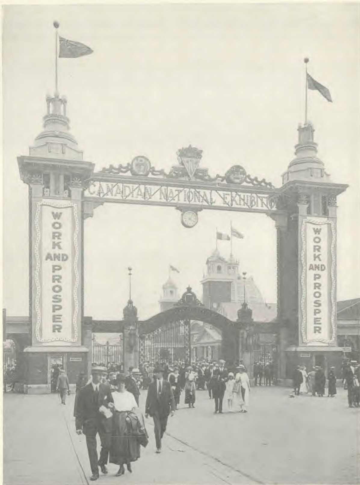
Entrance to the Canadian National Exhibition, at Toronto, Ontario, the world's greatest annual Fair.