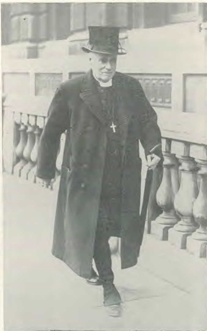
The Archbishop of Canterbury on the way to a meeting of the Crown Commission of the Privy Council.

But our interlocutor is not yet satisfied, let us suppose. He still asks if we have been fair to the evolutionist. Are