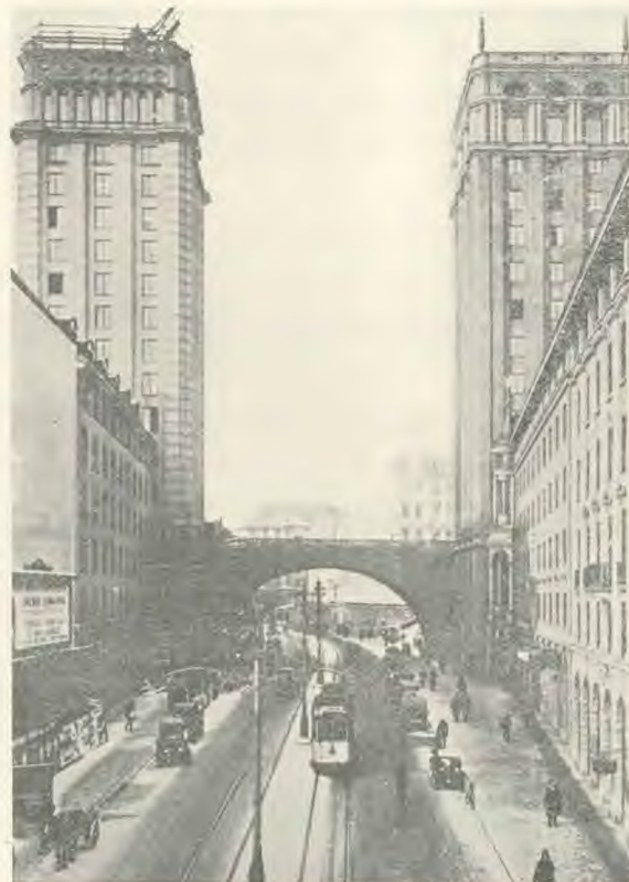
Skyscraper office buildings which have recently been completed in Stockholm, the Capital of Sweden.

Just here arises the much mooted question of optimism and pessimism, and this I think is a case in which these terms need reversal. I merely