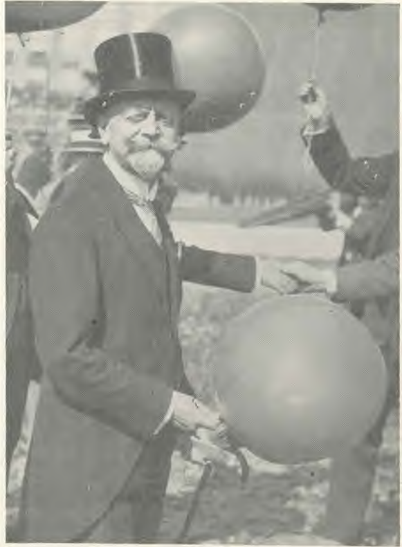
Burgomaster Max, celebrated war time head of Brussels during the German occupation of his country, releasing a test balloon before the start of the James Gordon Bennett Balloon Race last summer.

Russellism utterly denies the teaching of the Bible that Christ's second coming will be visible and open, in the sight of all the world. This false system would have us believe that Christ's second advent is already past, having occurred in 1874, as a secret event, and that He is now