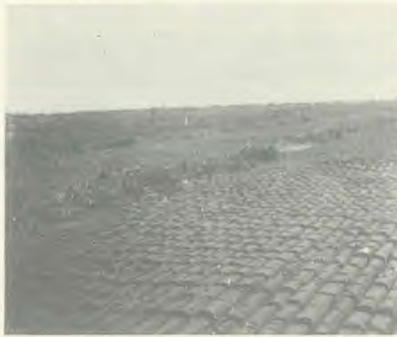
Drying peat at Alfred, Ontario. A new Canadian fuel product.

cite them, however, as popular terms, for I myself am neither optimist nor pessimist, but simply a plain Christian who seeks to know the truth and to have grace to be led by it. The worldly Christian, however, proclaims me a pessimist because I venture to declare that the flood of evil in the world is so great that I expect Christ's return at any moment to overthrow it utterly, fulfilling the prophecy