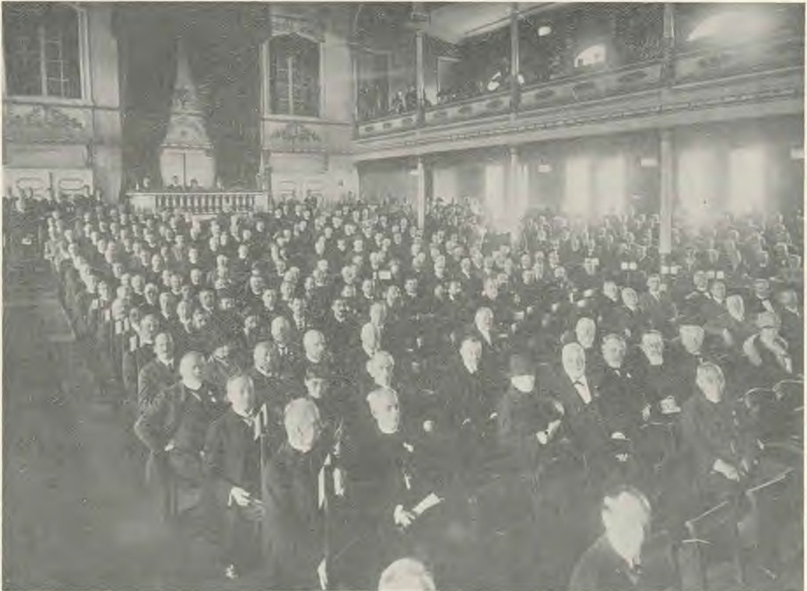
Universal Christian Conference at Stockholm. Over 600 clergymen, including 160 from America, studying ways and means of extending the Gospel and curing the world's ills.