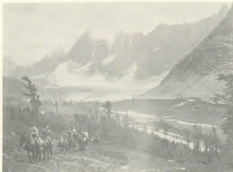
In the Canadian Rockies, nearing Wolverine Plateau, showing Tumbling Creek and Glacier.

Of the three vitamins, A is the easiest to preserve. It appears to be fairly stable. In preserved foods it is found that the vitamin slowly oxidizes. Canned foods, with the exception of tomatoes, contain much less of the vitamins than fresh foods. Tinned tomatoes have been found to contain all three vitamins, due probably to the presence of the acid.