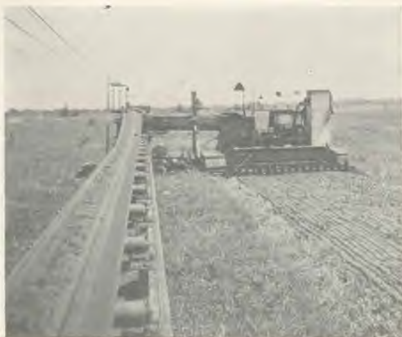
RIGHT—Preparing peat for fuel at Al- fred, Ontario.