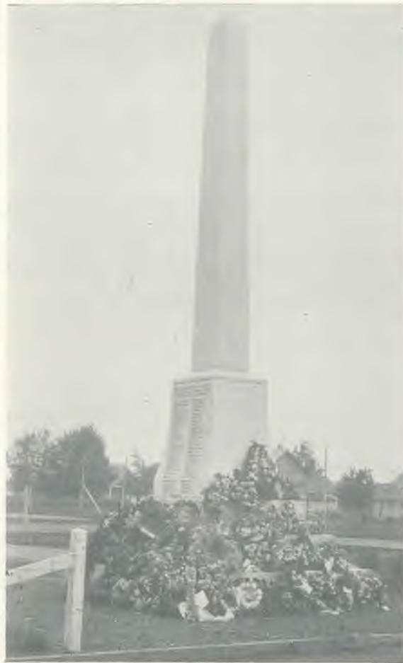
War Memorial at Stettler, Alberta. It is of British Columbia granite, and was recently unveiled by His Excellency, Lord Byng.

The coming of Christ frees us from the presence of sin."