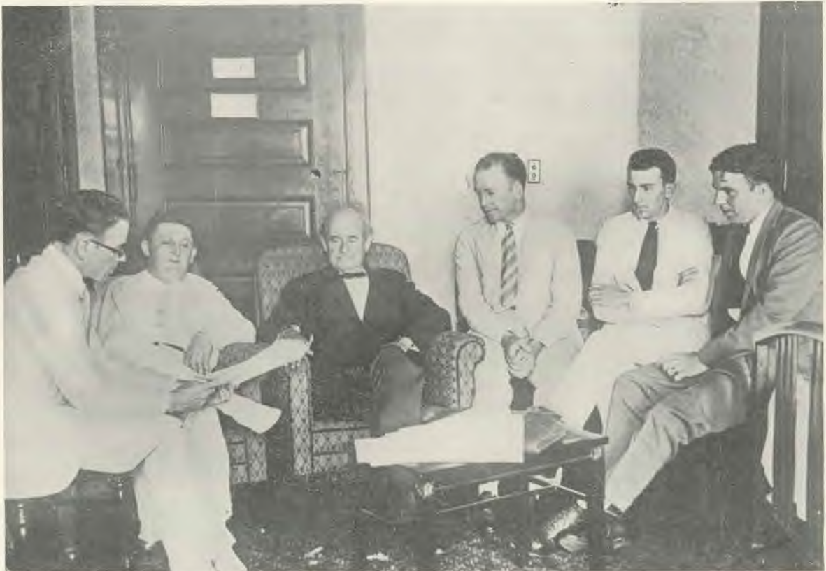
The late Wm. Jennings Bryan, taken at Dayton, Tennessee, a few days before his death. He is shown in council with prosecution attorneys in the celebrated Scopes case.

Be fair, and do at least one decent act every day in the year.— Specialty Salesman.