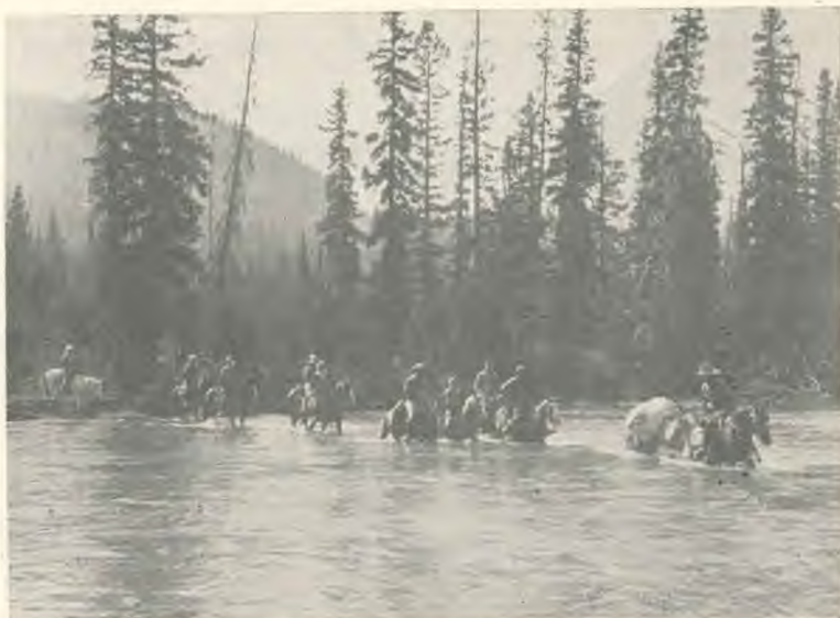
Fording the Vermillion

Our two great enemies—drink and war—have levied an awful toll upon humanity the last