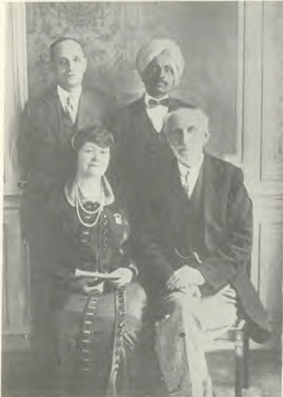
Four "High Priests" of Spiritism, from United States, England, and India, who are attending the International Spirit Congress in Paris.

Books by the score and hundred, have been, and are, coming from the press, teaching the doctrines of Spiritualism. The daily press and the magazines are filled with its claims, its pretensions, its teachings, and accounts of its phenomena. It has its prominent and well-known spokesmen, who describe its workings to great audiences, and multitudes of mediums ply their trade throughout all lands.