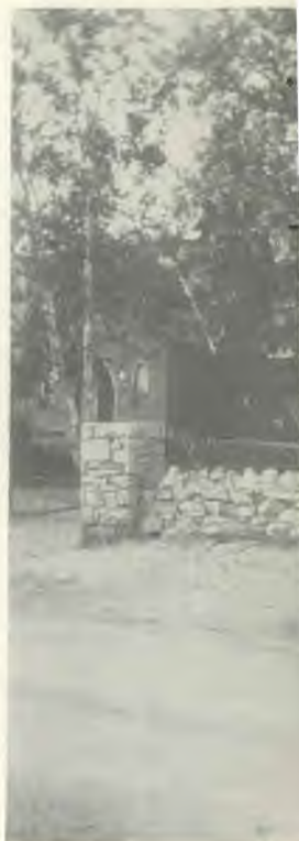
ABOVE —War Memorial at Cap was erected by summer visitor ceremony was performed by Sir distinguished visitors was Chief