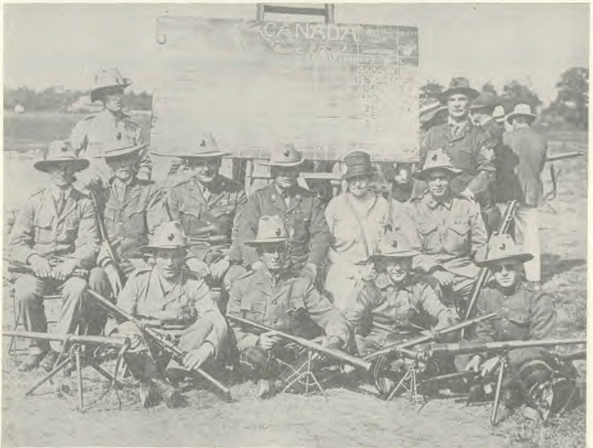
The Canadian rifle team, which won the Cup at Bisley, England, in the 1925 Meet. They defeated the Mother Country team by two points.