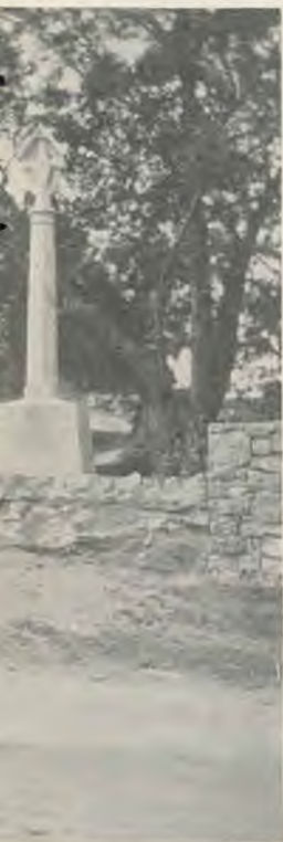
Aigle, Quebec. This memorial to that district. The unveiling by Charles Fitzpatrick. Among the guests was Justice Taft of the United States. ▲ Marine Plateau, B. C., meet the party.