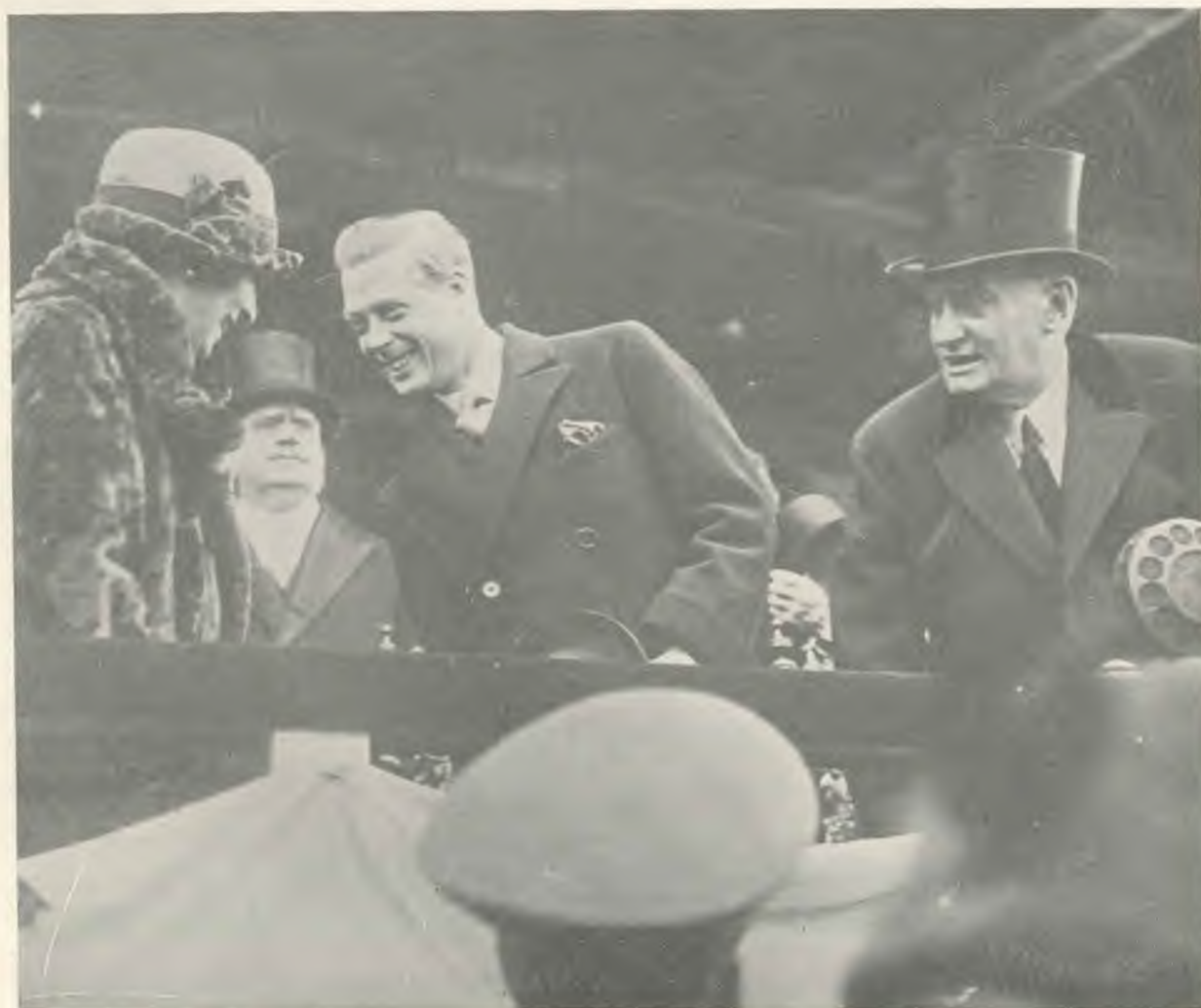
The Prince of Wales in South America. Britain's messenger of good will and friendship acknowledging the greeting of the wife of the President of Argentina. On the right is shown the chief executive of Argentina. A microphone that picked up the greetings of the President and the Prince's acknowledging address is shown in front of the President.