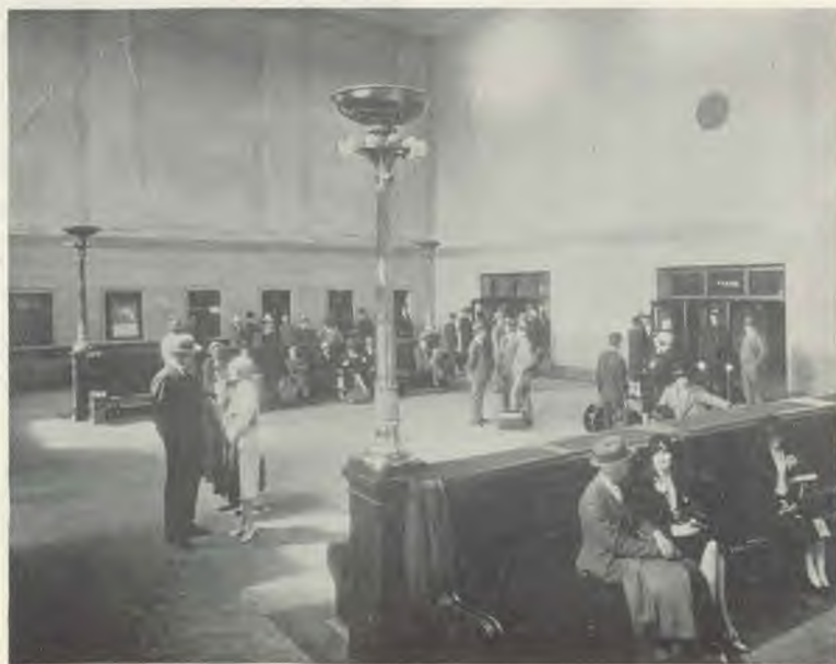
Main waiting room of the C. P. R. North Toronto station.