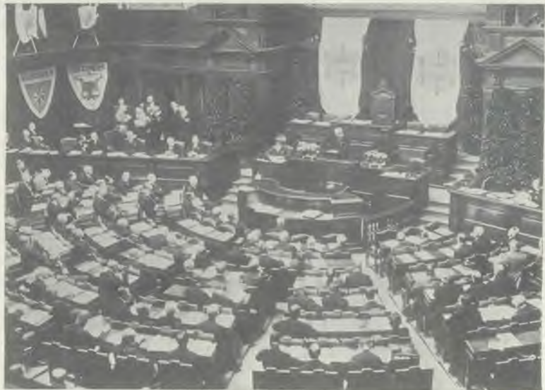
PLANNING TO COPE WITH THE UNIVERSAL CRIME WAVE

Money lust, power lust, blood lust, and sex lust produce the same results the world over, whether they are clothed in the flowing robe of the Turk, the brilliant silks of the Chinese mandarin, or the dignified broadcloth of the Westerner. Wallingford may glide up to a mansion in his limousine and