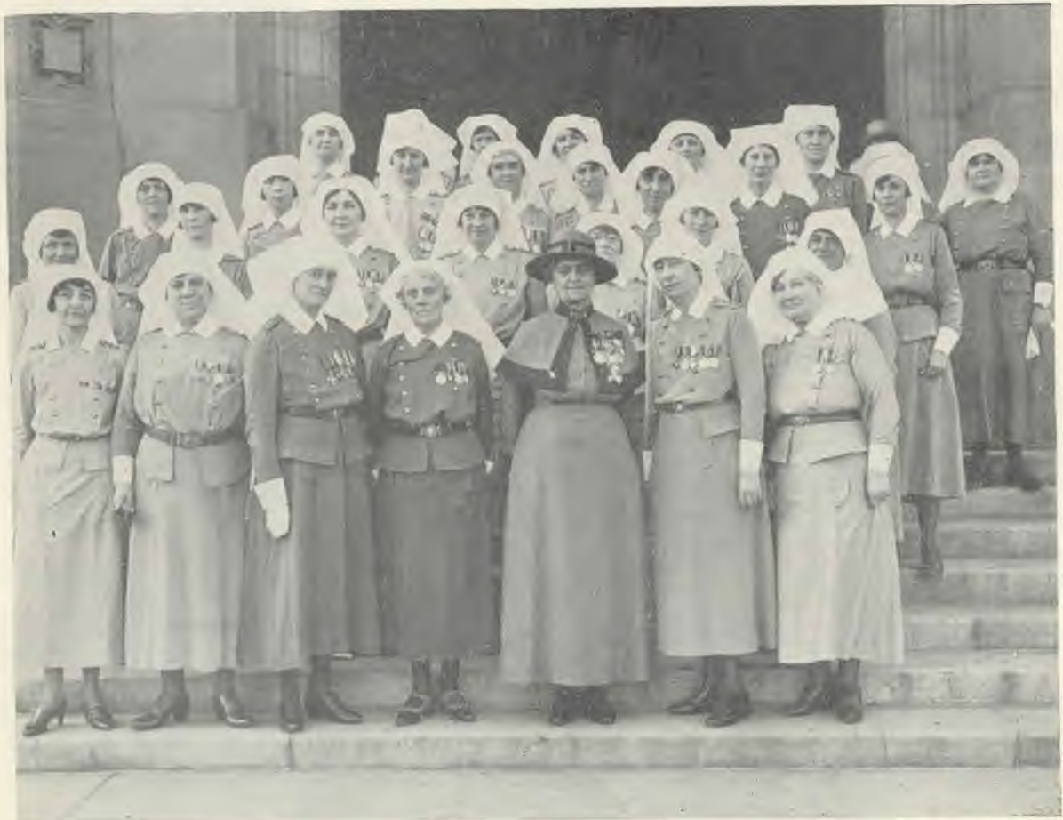
An interesting group of war nurses who attended the unveiling at Ottawa in August of the memorial to Canada's nurses who died in service during the Great War.

IF we do not reach that high position which we desire, we ought not to ascribe it to the obscurity of the place where we were born, but to our own little selves.—Plutarch.