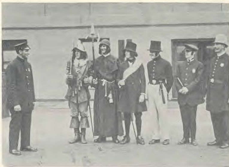
Uniforms of policemen, left to right, of 1614, 1650, 1750, 1830, 1865, 1900. From the time Sir Robert Peel reorganized the police force in 1829, the nickname "Bobby" has clung to the English policeman.

What are these mysterious influences that are at present wrecking the world structure from west to east? We read that it is none other than "the spirits of devils." Speaking of the end of time, the revelator says that he "saw three unclean spirits like frogs come out of the mouth of the dragon, and