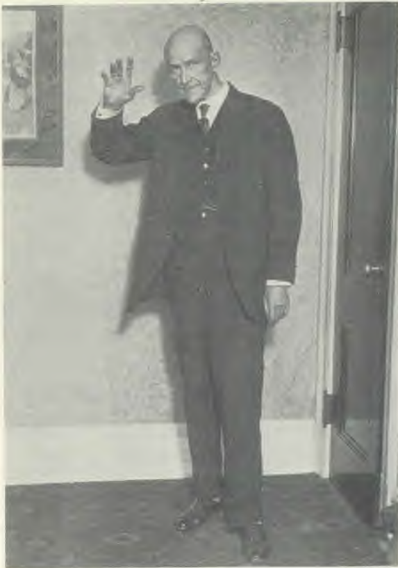
Eugene V. Debs, strong political leader of the Socialist Party, and several times their presidential candidate, who recently passed away in a sanitorium in Chicago, at the age of seventy-one.

that they are in a minority and should restrain themselves in the interests of public safety. As surely as the automobile has come to stay, so surely whisky must go.