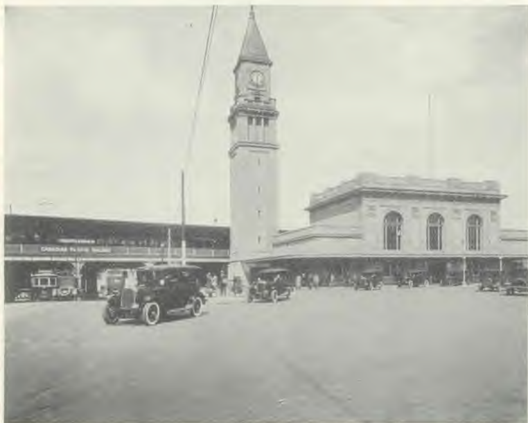
An up-to-date terminal—the C. P. R. North Toronto station.