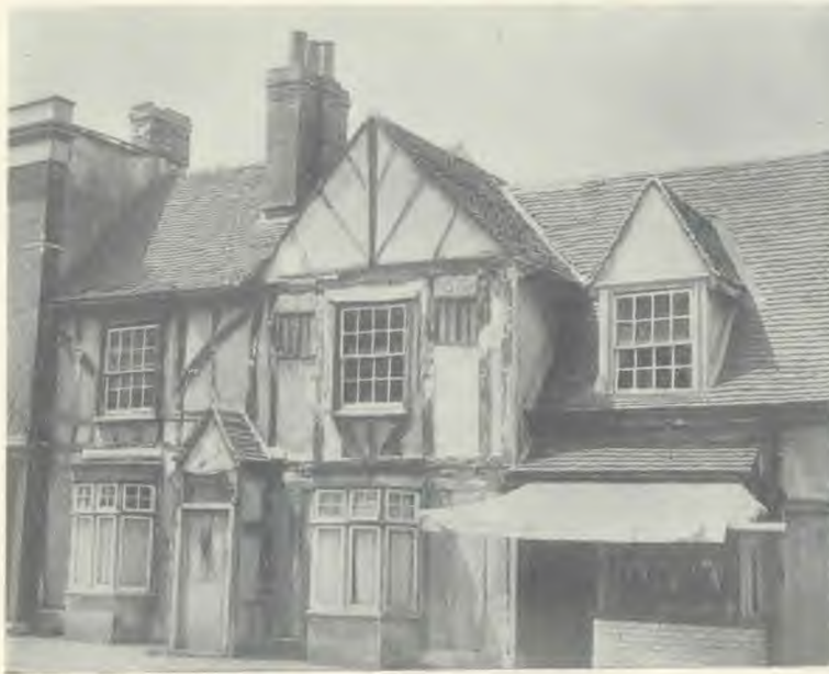
HISTORIC BRITISH HOUSE FOR AMERICA

NEVER trifle with truth. A lie is bad, not only because it may lead others astray, but also because it is a fault in the character of the one who utters it. Truth is the foundation and substance of character. When a man becomes a liar, his character is gone. His whole life is out of joint. No one can trust him. He cannot trust himself. He is like a bridge with a rotten foundation. He is not safe. He is an unsafe friend, an unsafe neighbour, an unsafe business man. "Buy the truth, and sell it not."— The Christian Advocate .