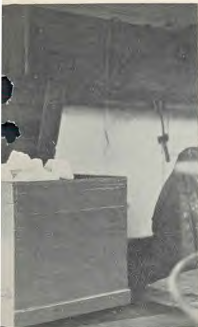
S. S. "Empress of Asia," successfully at Kobe, Japan, to be used in stocking packed in ice and kept at an even ong voyage.