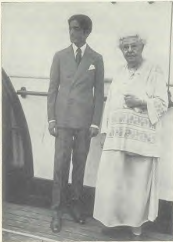
Jeddu Krishnamurti, the youthful Hindoo who is hailed by the theosophists as the "New Messiah." The photograph was taken with Mrs. Annie Besant, when they arrived in New York for a tour of America. It has since been reported that he has suffered a nervous breakdown. Jesus said, "Many shall come in My name . . . and shall deceive many"; "Behold, I have told you before."

Paul does say that "the mystery of iniquity doth already work" (2 Thess. 2:7), and John asserts (1 John 2:18) that "even now are there many antichrists." But Paul looked forward to a "falling away," an apostasy out of which was to come "the man of sin," and John in the same verse in which he says "even now are there many antichrists," says also "that Antichrist shall come."