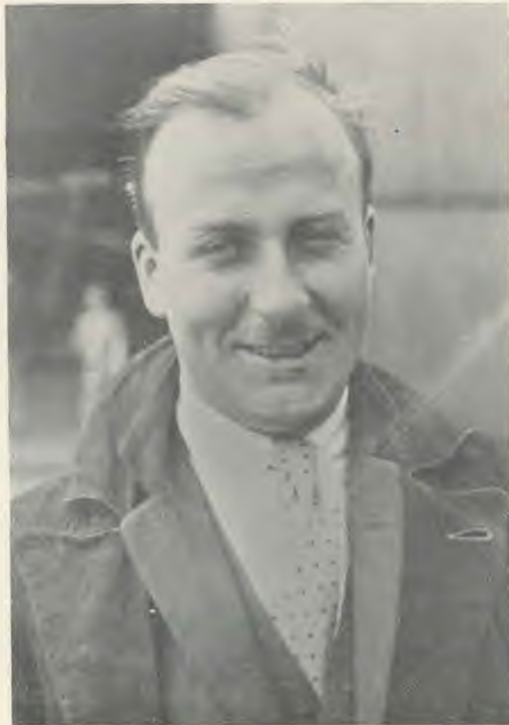
Alan Cobham, the famous British airman who recently flew from England to Australia and back.

What is the meaning of this scourge of worms and scales and caterpillars? The prophet Joel