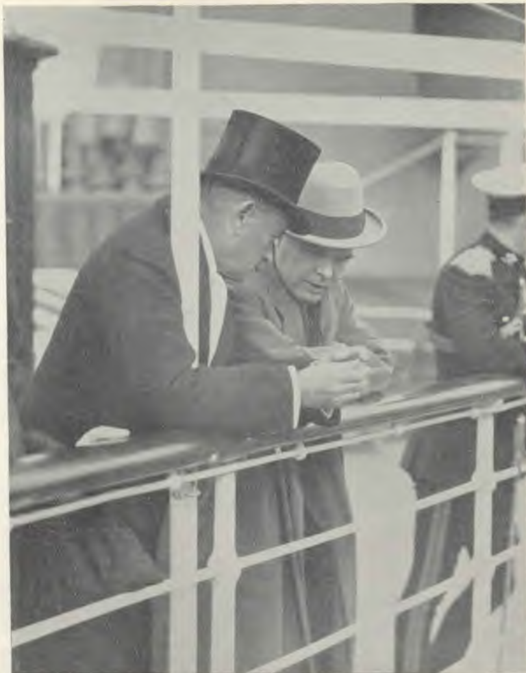
Lord Byng conversing with Mr. E. W. Beatty, president of the C. P. R., on the deck of the "Empress of France" just before leaving Quebec City for his home in England.