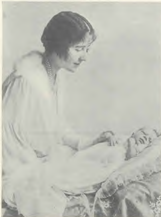
A charming portrait of the Duchess of York and her infant daughter, Princess Elizabeth, either one of whom may some day be Queen of Great Britain.

This unity or integration of purpose is an ideal