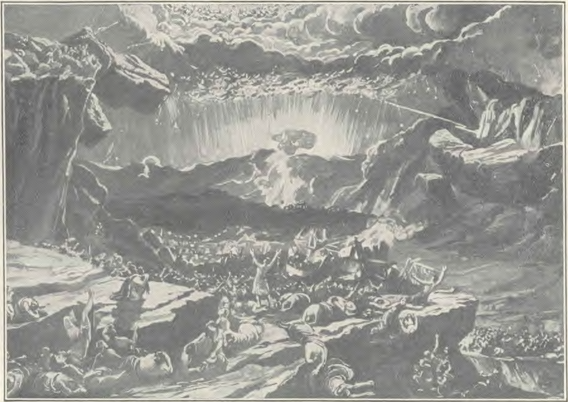
The wicked crying to the rocks and mountains, "Fall on us, and hide us from the face of Him that sitteth on the throne . . . for the great day of His wrath is come; and who shall be able to stand?" Rev. 6: 16,17.

Secondly, there must be subjects over whom the kingly rule shall extend. These are supplied by the glorified ones who are redeemed from this earth