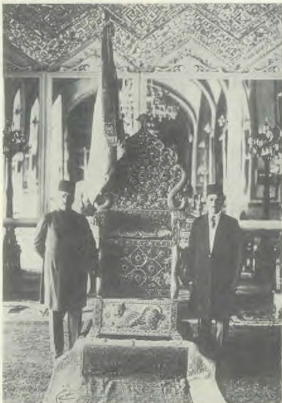
The famous Peacock Throne of Persia, the coronation seat of the ancient kingdom of the Medes and Persians. The intrinsic value of the throne is said to be $50,000,000. Medo-Persia became the second great universal empire in history when Cyrus the great entered the city of Babylon on that night of Belshazzar's feast. In the midst of revelry, the handwriting of doom appeared on the royal palace wall.

In Geneva we saw a tablet chiseled to the memory of Woodrow Wilson, and walked along the street fronting on beautiful Lake Geneva named for him—all this done to perpetuate the memory of the one chiefly responsible for the creation of the League of Nations, the home of which is in this city and looks out upon this same lake. But his own people have denied him much of the glory these people have bestowed upon him, and