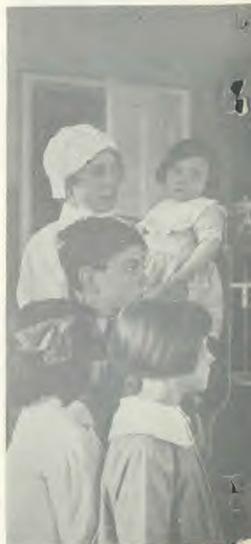
The Prince of Wales recently visited Toronto and was artistically decorated in sugar, to the delight of the children.