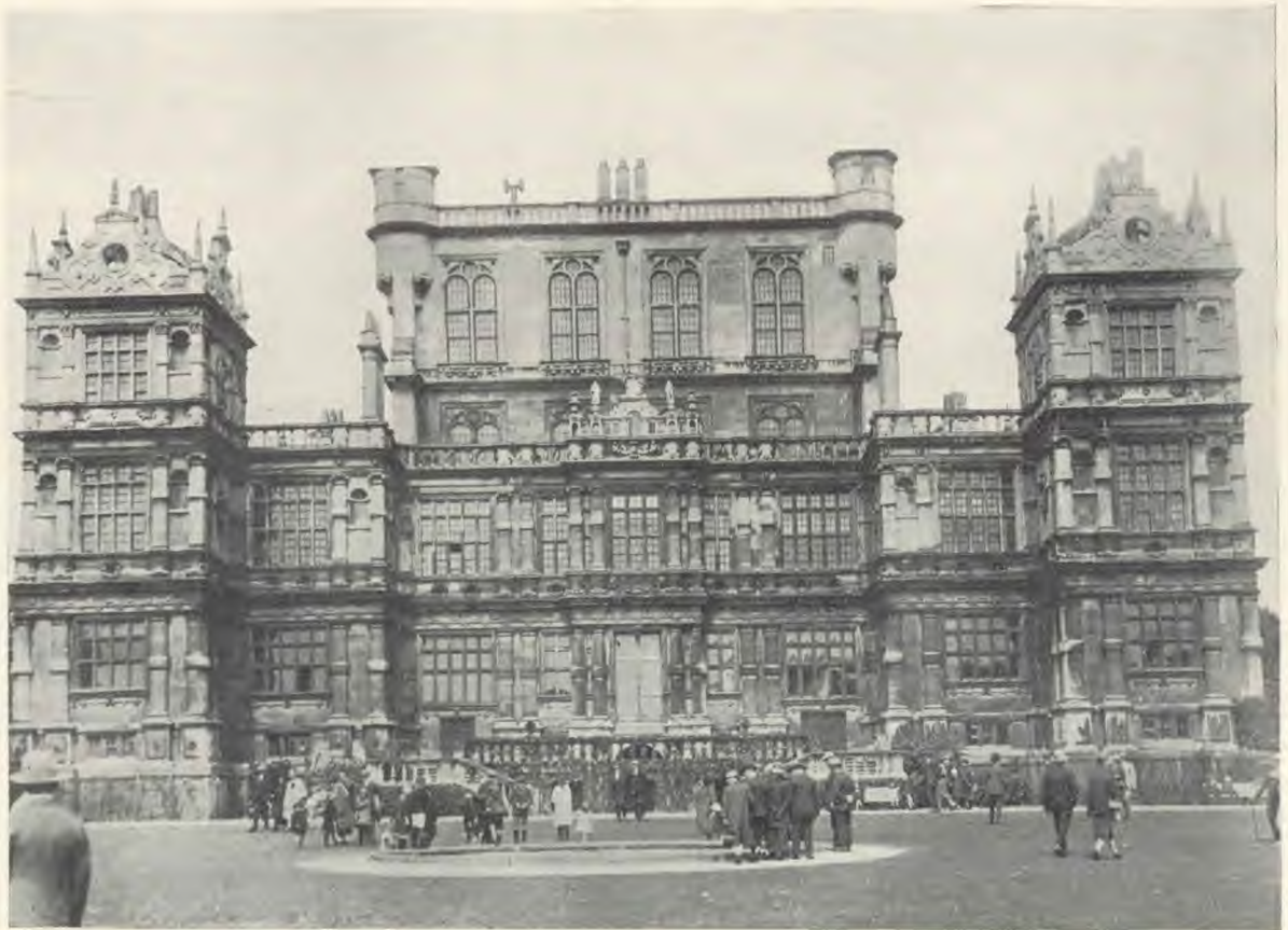
NOTTINGHAM NATURAL HISTORY MUSEUM

But how different it all is today! The exalted occupants are no more—or no more here . The common people rule today; and this palace of emperors is a museum, one of the most wonderful in the world—and it belongs to the people. They