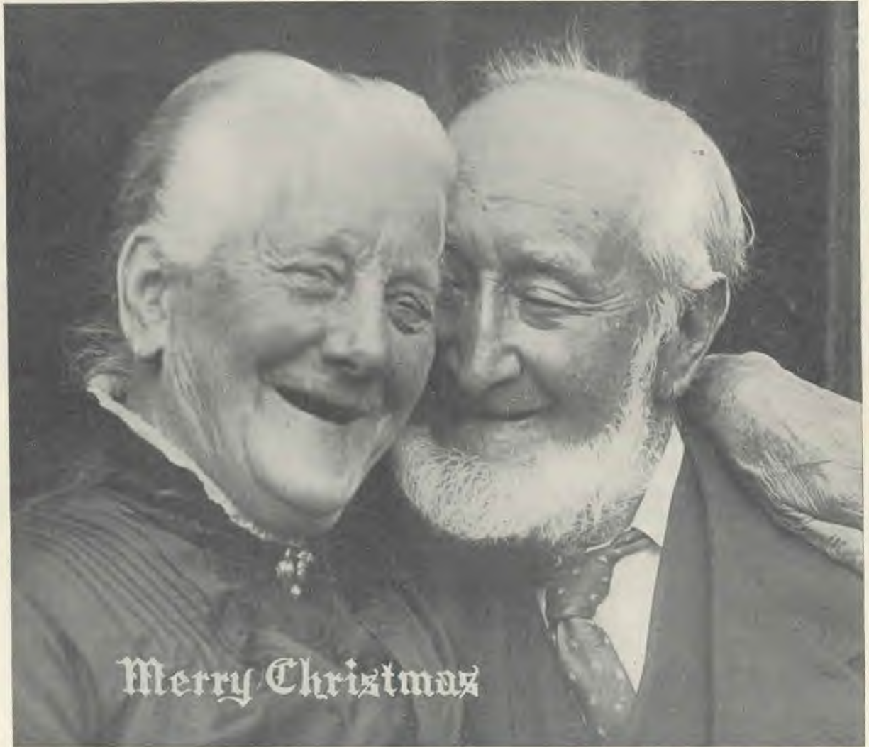
A wonderfully happy picture of Mr. and Mrs. Nottage, of Hertfordshire, England, on the occasion of their diamond wedding. It is their proud boast that they have never had an angry word.

“Saving Marriage from Bankruptcy” See Page 6.