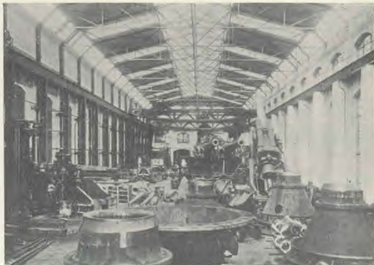
THE GREAT ARTILLERY PLANT AT BOFORS, SWEDEN

The rule of the Caesars had been in existence for a century before the days of the New Testament writers, but they speak of Antichrist as future, and never hint that the Roman emperors were such.