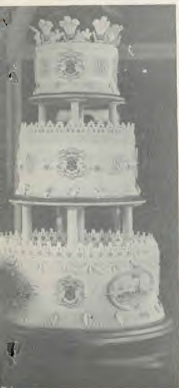
med cake weighing 300 pounds, Victoria Hospital for Children, Chelsea, and.