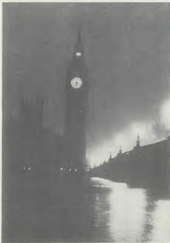
TWILIGHT ON THE THAMES

It consists of nine semi-elliptical arches, each span of 120 feet.