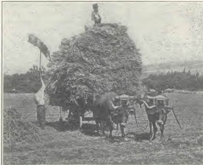
Physical work, out in the fresh air of God's out-of-doors, was largely responsible for the strength of nervous energy which our grandparents possessed.

What is going to be the effect on our nerves of this new experiment in human achievement? for we have not yet learned how to make new nervous systems on quantity production. An engineer driving the