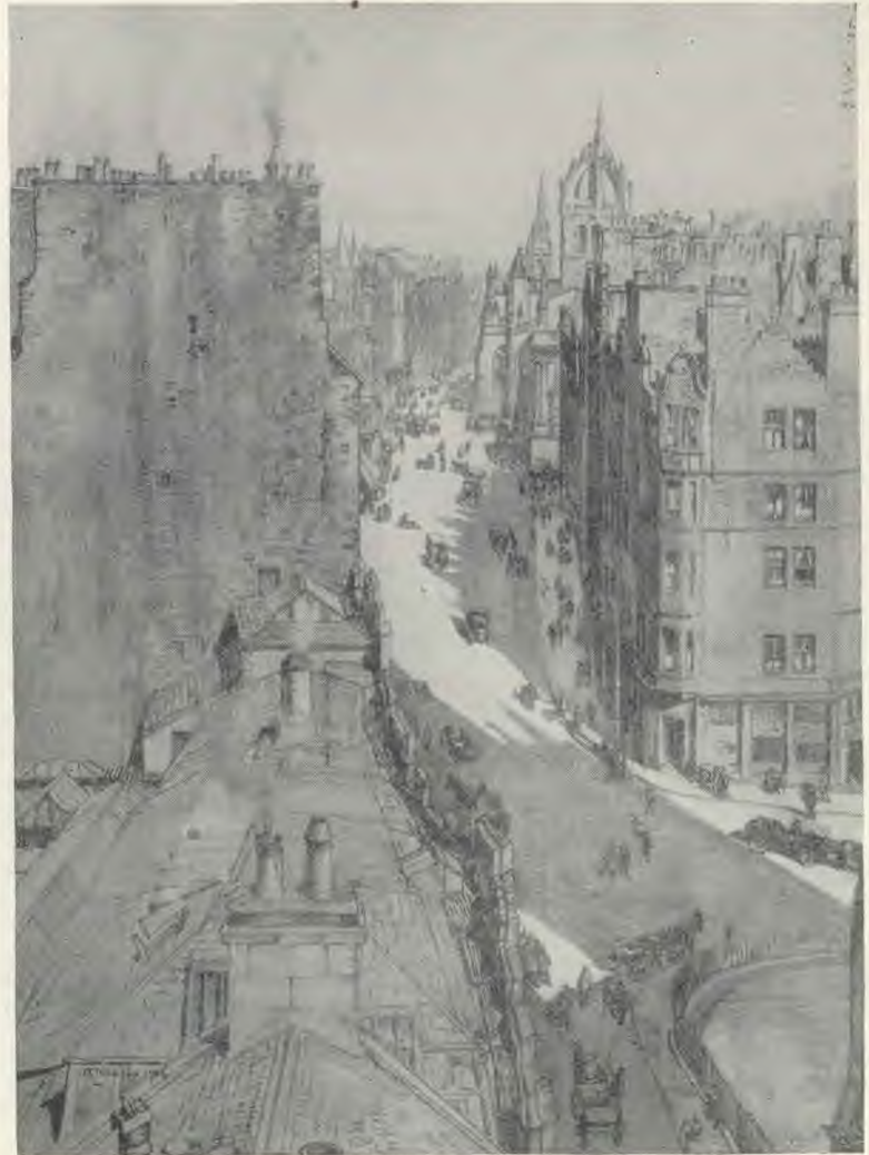
An exceedingly interesting view in historic Edinburgh, Scotland.

It is of more than ordinary interest to note that other lines of prophecy locate "the time of the end" as beginning about 1798. We have already observed that it was just about this time that the