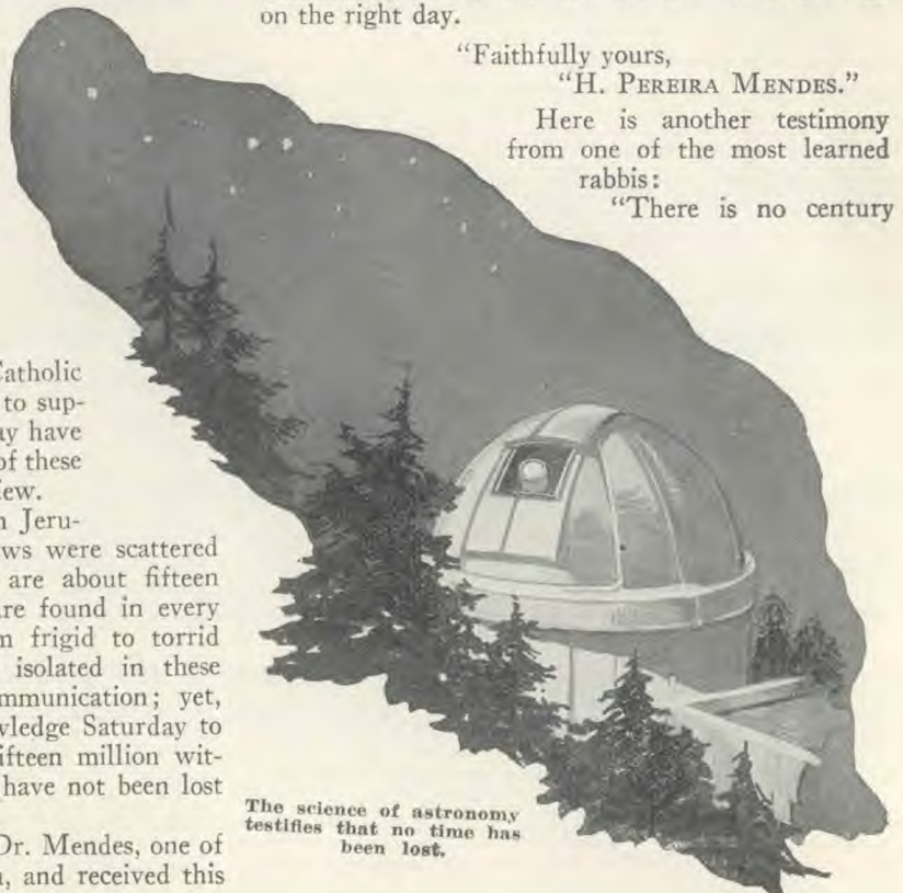
The science of astronomy testifies that no time has been lost.