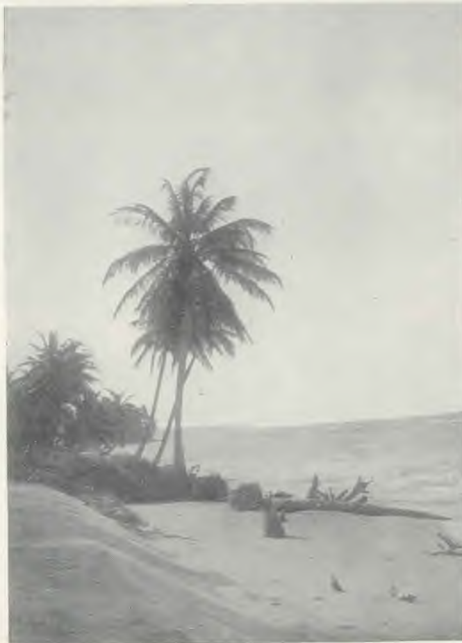
A beautiful Jamaican beach noted for the variety and beauty of the sea shells found there.

One big trouble with our nerves is the multitude of things that press us at one time for consideration, like so many persons trying to get into our office at one moment until we don't know which one to see first. Try to make your problems stand in a row, then take the first one and shut the door till you are through. Now take the next one, and you will not only save time but feel less tired when you are through. This is the secret of the large amount of work accomplished by many men who refuse to break down but seem to fatten on work. Many nervous persons who complain of being all run