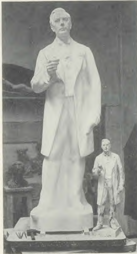
A statue of Joseph Chamberlain by the famous British sculptor, John Tweed. It will stand in the lobby of the House of Commons as a memorial to this great Imperial statesman.

"The epoch of dizzy progress we experienced during the last century is definitely over.' Improvements, he says, and innovations there will certainly be, but they 'will not have the same significance as formerly. . . . We are living today in the most critical period of human history,' he continues, and explains that 'today we abruptly find ourselves face to face with the