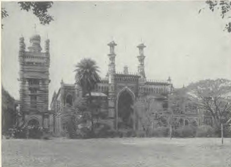
THE CHEPAUK PALACE, MADRAS

This handsome building was formerly the palace of the Nawabs of the Carnatic, which came under British rule in 1801 and now forms part of the governorship of Madras. The district abounds in temples, some of great age and beauty.