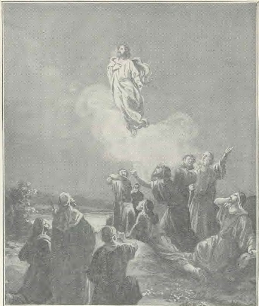
"Ye men of Galilee, why stand ye gazing up into heaven? This same Jesus, which is taken up from you into heaven, shall so come in like manner as ye have seen Him go into heaven." Acts 1: 11.