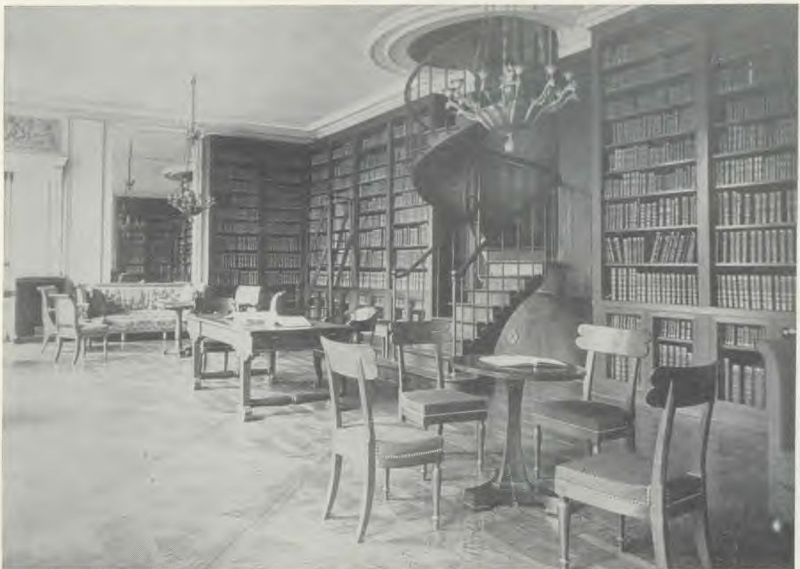
Napoleon's library as it appears after being repaired recently. The narrow stairway at the back leads to Napoleon's private study.

"Cheer up! Some successes are more disastrous than failures. Aim at big achievements, and take the incidental backsets as they come. Go after the best, and be willing to pay the highest price. Something got for nothing is worth just what it costs."