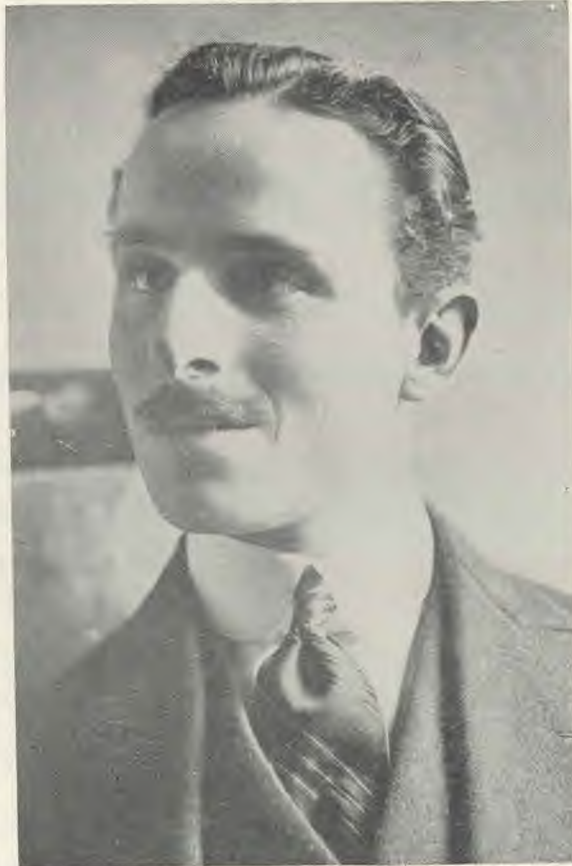
Oswald Mosley, aristocratic Socialist member of Parliament elected by a large majority in a hotly contested three-cornered by-election in Smethwick, England. He is a son-in-law of the late Marquis Curzon. His father, who is a Conservative, declared during the election that Oswald never did a day's work in his life.

"But just before the world goes to pot there will be a flare-up of energy, as there was in Rome under the Caesars; the world will become an empire and the ruler will be—America. . . . To some of them it is a question whether a transfusion of blood from America would save (Cont'd. on page 30)