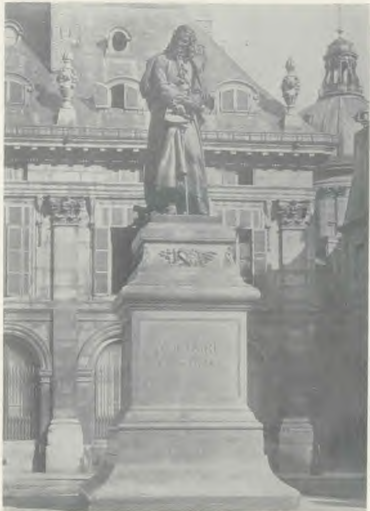
Statue of Voltaire, the brilliant eighteenth century radical, whose work prepared the way for the French Revolution. He was a lifelong foe of intolerance, but in misguided zeal he made war upon the Bible and the Christian religion.

The prophet declared that He was to be cut off, "but not for Himself," indicating a vicarious death. In the midst of the week He was to cause the "sacrifice and oblation (offerings) to cease." Every Bible student knows well, that the ministry of Christ from His introduction as the Messiah at His baptism, to the cross, was three and one-half years.