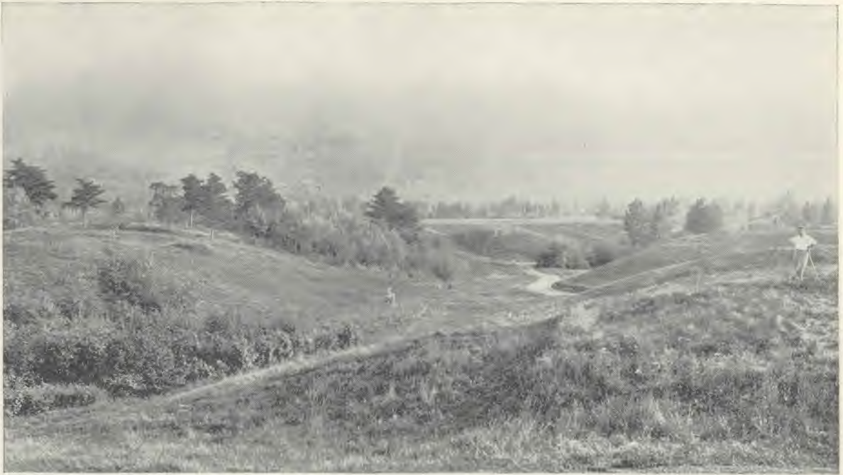
The golf grounds and Country Club at Fort William, Ontario

When He was "cut off out of the land of the living: for the transgression of my people was He stricken," (Isa. 53:8) "the veil of the temple was rent in twain from the top to the bottom," (Matt. 27:50, 51) thus indicating that the sacrifices and offerings of the Jewish ritual in Solomon's temple should cease. Thus was fulfilled to the very year and in the most remarkable manner, the prophecy of Daniel concerning the time of the first advent.