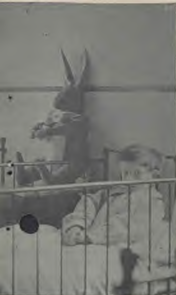
...ing ceremony of the Princess Louise The Queen at one of the cots.