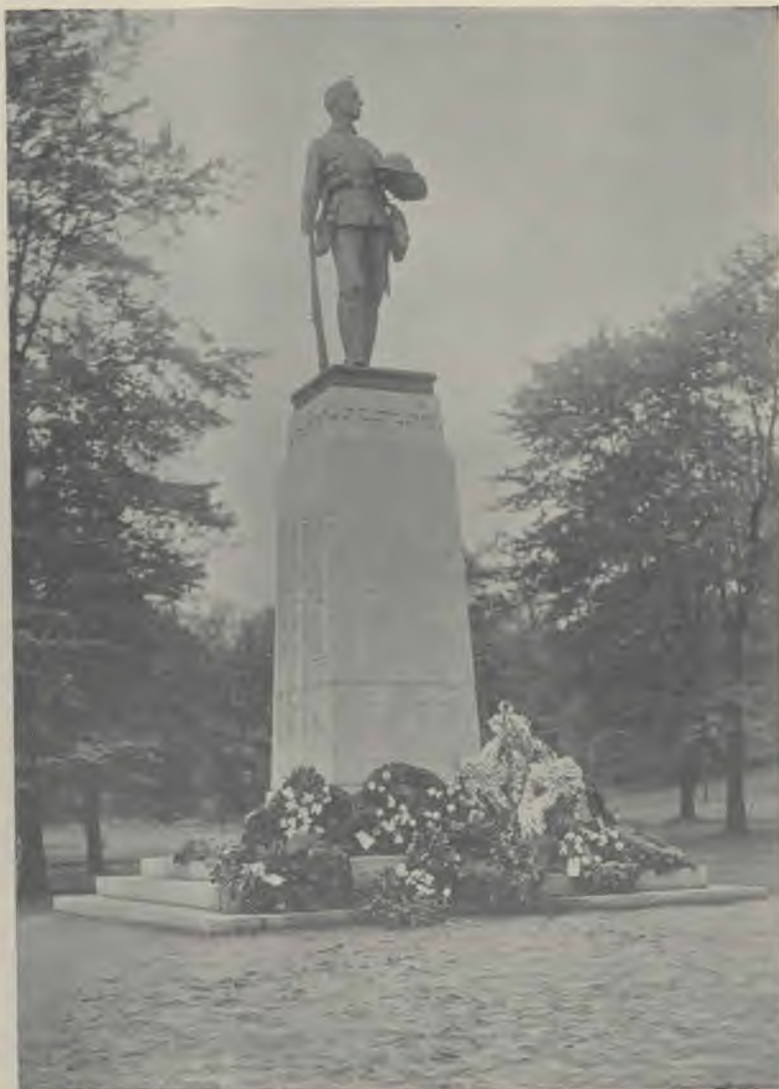
Soldiers' War Memorial, Niagara Falls.

In keeping with this prophecy we are warranted in looking for a world wide evangelizing missionary movement just after 1840, that would mark the finishing of the gospel work in the earth and prepare the way for the culminating events of the seventh trumpet, which include the judgment day, the punishment of the wicked, and the reward of the people of God. "And the seventh angel sounded; and there were great voices in heaven, saying, the kingdoms of this world are become the kingdoms of our Lord, and of His Christ; and He shall reign forever and ever. And the four and twenty elders, which sat before God on their seats, fell upon their faces, and worshipped God, saying, We give Thee thanks, O Lord God Almighty, which art, and wast, and art to come; because Thou has taken to Thee Thy great power, and hast reigned. And the nations were angry, and Thy wrath is come, and the time of the dead, that they should be judged, and that thou shouldst give reward unto Thy servants the prophets, and to the saints, and them that fear thy name, small and great; and shouldst destroy them which destroy