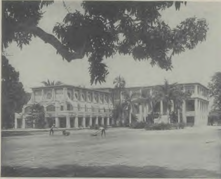
King's House, St. Andrew's Jamaica, British West Indies.