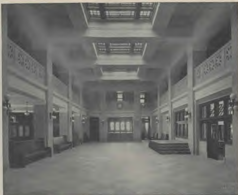
Interior view of the new Canadian National Railways' depot at the Alberta capital.