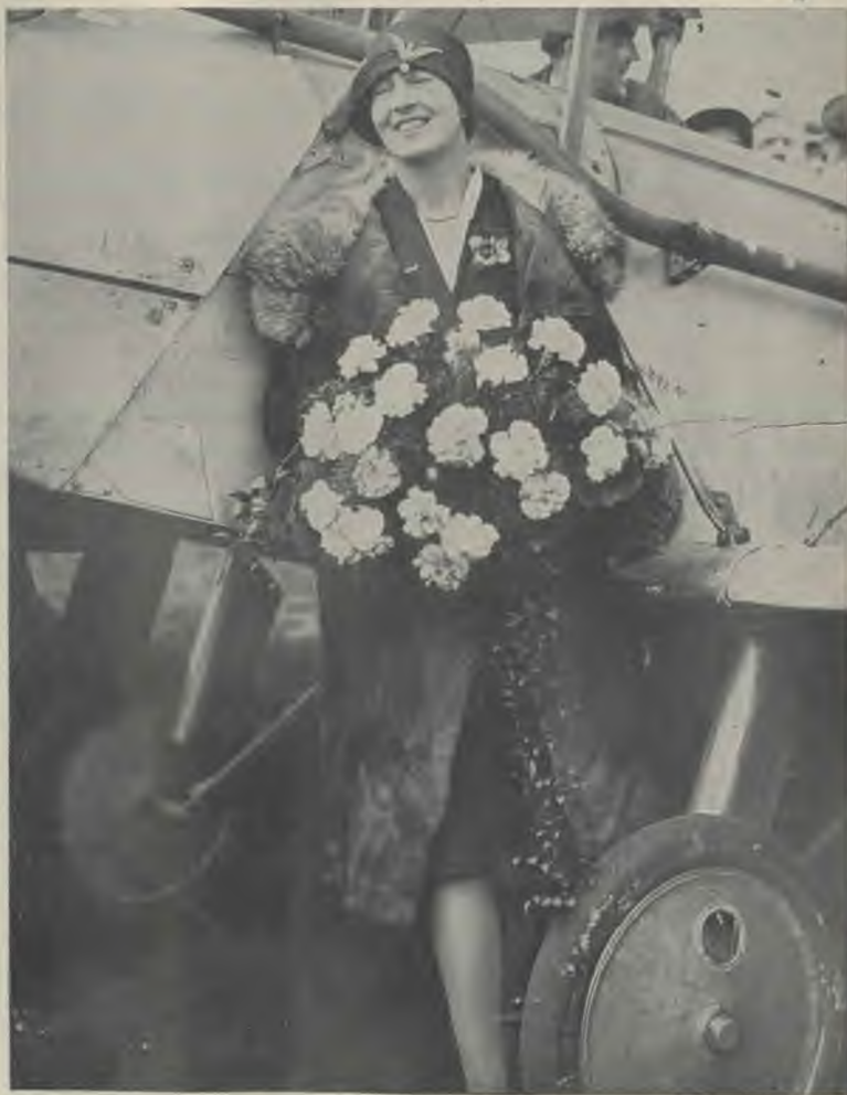
Lady Heath, formerly Mrs. Elliott-Lynn, on her arrival in Europe from Cape Town, South Africa, by air after covering 10,000 miles.

The trouble with the old orthodoxy was this. It