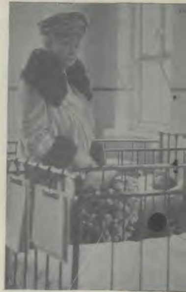
The King and Queen attended the Kensington Hospital for Child