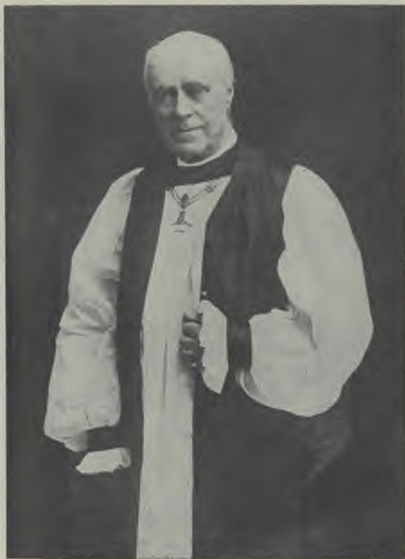
The man in the pew is puzzled. "What shall we believe?" he inquires. "The minister of today contradicts the parson of yesterday."

" Noah's Ark : 'To collect pairs of animals from all quarters of the globe into one place would be a