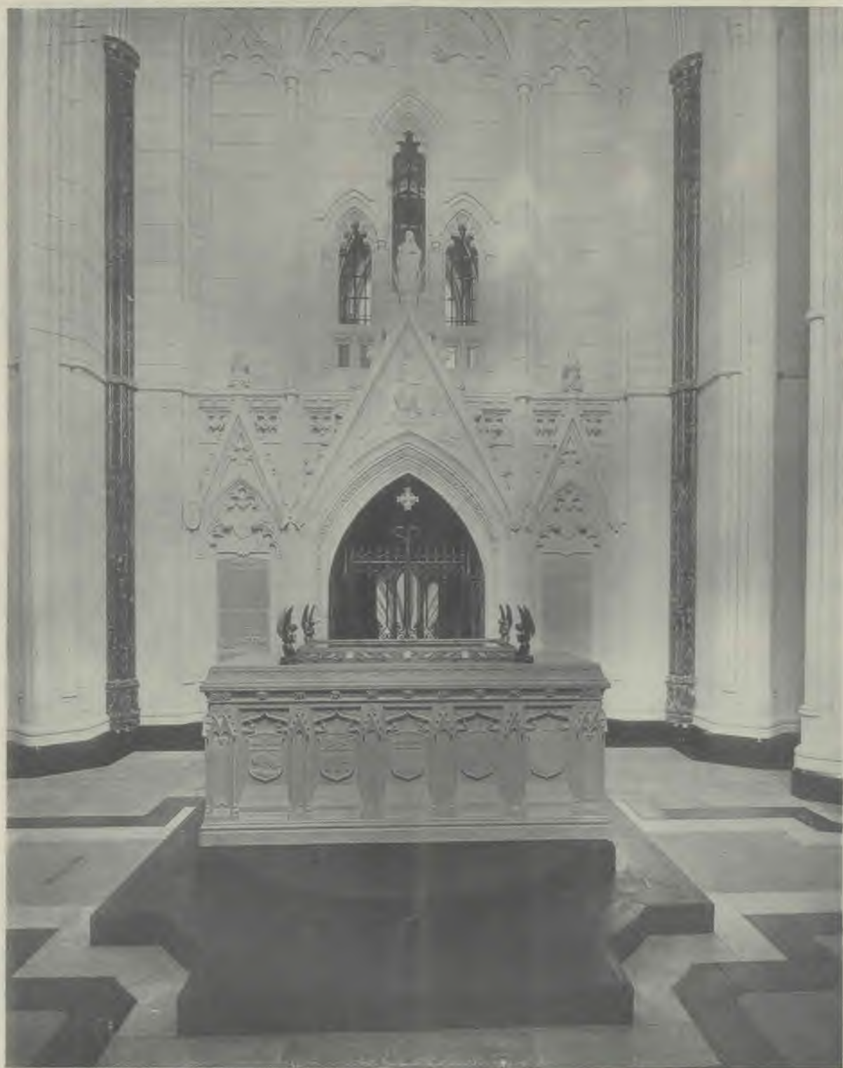
This beautiful chamber in the Hall of Remembrance in the Parliament Buildings at Ottawa was recently dedicated to the memory of the men who fought and sacrificed in the World War.