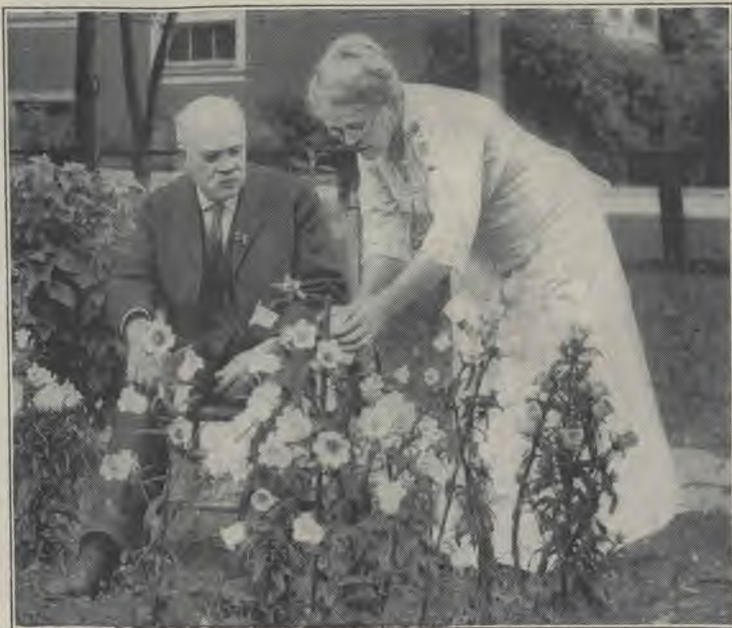
The only power which can make two hearts beat as one is a pure unselfish love.

The marriage vow has united two in one, and forever, so long as time for each shall last. From that decision there is rightfully no turning aside. Let neither ever harbour the thought that in their union they have made a mistake. Life never is perfect; in every union there is bound to be some defect, and we can remedy it only by facing it, never by running away from it. Whatever disappointment there may be, determine to better it by drawing