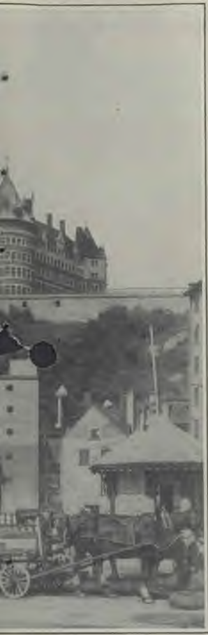
(Canadian Pacific Railway.)