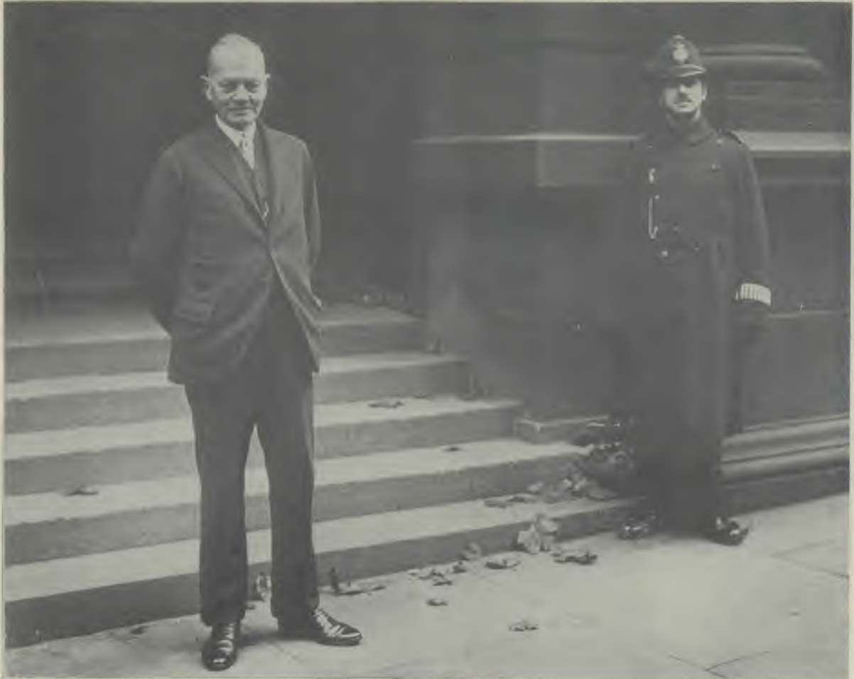
LORD BYNG AT SCOTLAND YARD

Warnings of prophets were disregarded, until at last, God delivered his ultimatum through Jeremiah. If Babylon should not be evicted from its stolen