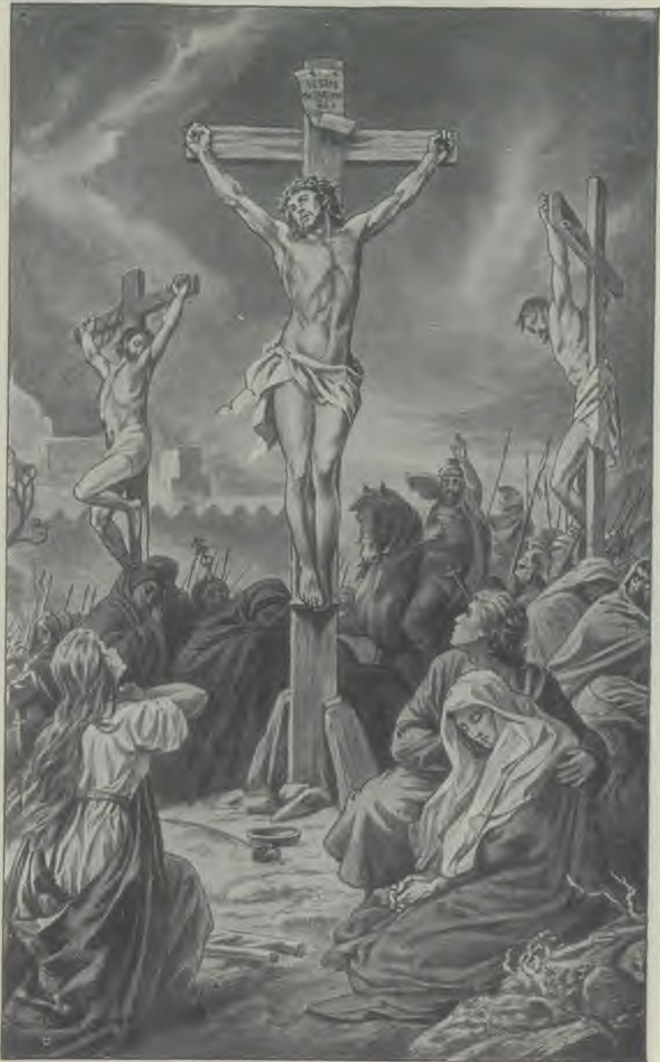
There is no gospel of salvation apart from the cross.

This principle is recognized and asserted in the scriptural explanation of the universality of sin: "Through one man sin entered into the world, and death through sin; and so death passed upon all men, for that all sinned." Rom. 5:12. All sinned in the one man, Adam, because all were in him, just as Levi paid tithes when Abraham paid tithes, because he was in Abraham when Abraham paid tithes. Heb. 7:9, 10. But the first Adam "is a figure [or type] of Him that was to come" (Rom. 5:14);