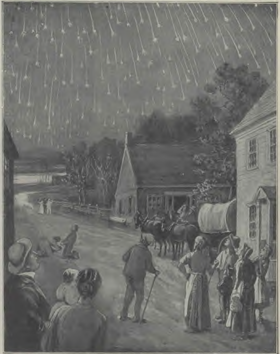
THE FALLING STARS OF NOVEMBER 13, 1833. One of the signs of the Lord's near return.

"In many districts, the mass of the population were terror-struck, and the more enlightened were awed at contemplating so vivid a picture of the Apocalyptic image—that of the stars of heaven falling to the earth, even as a fig tree casting her un-