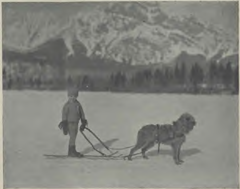
"Flu" germs don't like fresh air. Live where the birds live, live out-of-doors; close housing is a fruitful source of infection.

Case 3: Boy, aged seven years. In spring of 1927 he had measles, followed by kidney complication which lasted for several months. At this time the attention of the parents was called to a number of bad teeth and roots in the boy's mouth. These