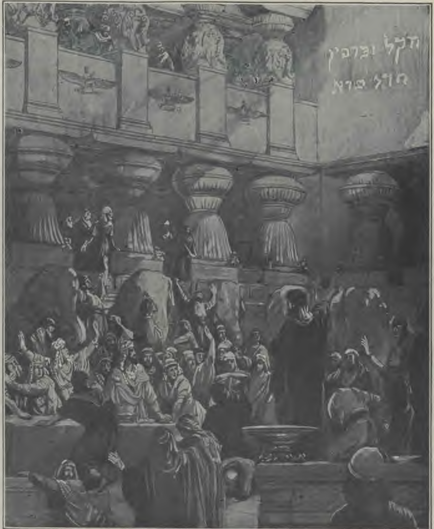
While they drank from golden vessels a hand wrote upon the wall the fate of the Babylonian kingdom. Earthly kingdoms will all pass away and God's eternal kingdom be established.

Arising from his bed in the morning, he found