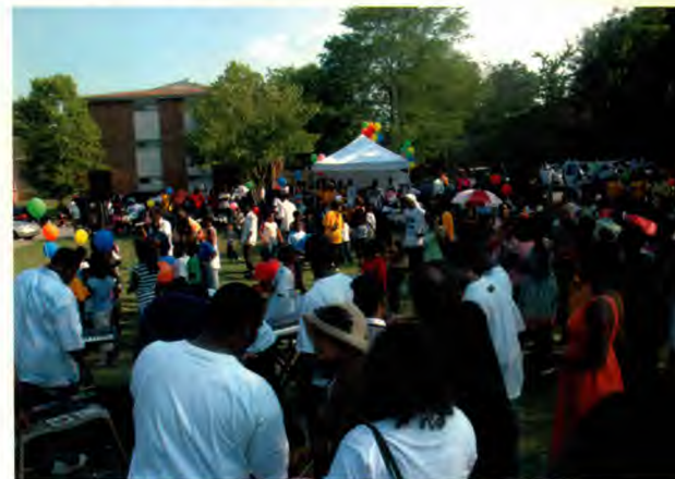
Hundreds of Atlanta Berean church members supported the event.

This was a joint effort for the members working with various church departments. The health and temperance department