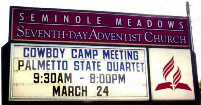
The Winter Springs, Fla., church's Seminole Meadows campus hosted the first "Cowboy Camp Meeting" held in the state.