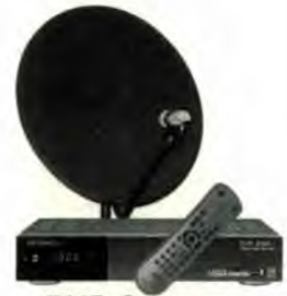
DVR System $339 + ship

Preprogrammed Receivers Self Installation Kit Included Detailed instructions provided One Year Warranty and Support