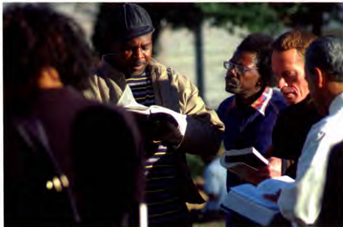
Members of the All Nations church in Atlanta, Ga., study the Bible with the homeless each weekend.

With eager anticipation, the community service workers load and board