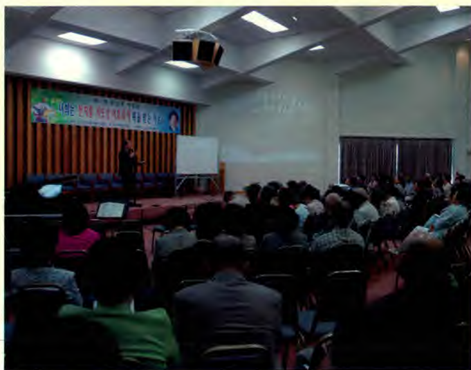
Hundreds of people gather for the annual Korean camp meeting at Cohutta Springs Conference Center in Crandall, Ga., May, 2007.

The Magnolia Auditorium at Cohutta Springs Conference Center in Crandall, Ga., was packed for the 17th annual Georgia-Cumberland Conference Korean camp meeting, held May 18-20, 2007.