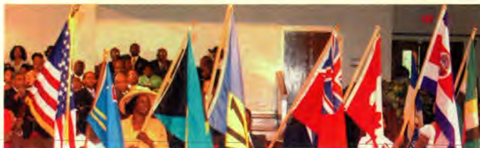
Members from various countries residing in South Central participated in a Parade of Nations on the final Sabbath during introit. This was an exciting new feature.