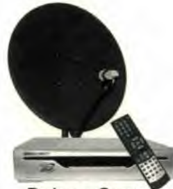
Deluxe System $179 + ship

Hope Channel, Esperanza TV, LLBN, 3ABN, 3ABN Latino, LifeTalk Radio, Radio 74, 3ABN Radio and ACN/ATN with NO MONTHLY FEES!