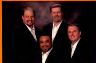
The King's Heralds