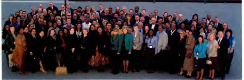
Almost 200 Adventist communicators attended 2006's convention in Baltimore, Maryland.