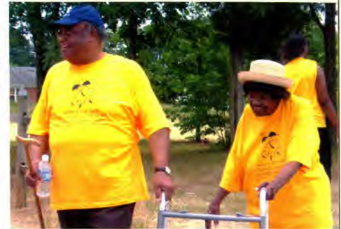
People of all ages participated in the walk.

Adventists, we have a duty to demonstrate the health benefits of obeying God's Word. The greatest ministry we each have is how we live our daily lives. People really pay attention to what we eat and how we take care of our bodies. As brothers and sisters in Christ, we should be constantly encouraging each other." Activities included a three-mile walk, healthy