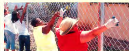
The students and staff help to install a new fence around the school.

blessing to the people and students in Panama, but also helped to enlighten the lives of those who traveled to Panama.