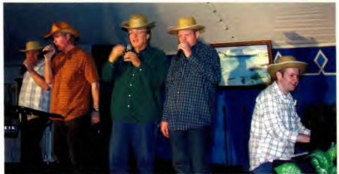
The marquee group for the camp meeting was southern gospel's Palmetto State Quartet.