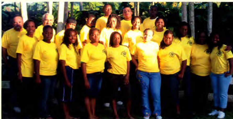
Miami Union Academy Jamaica mission trip team

On November 5-12, 2006, Miami Union Academy made history by traveling to one of Kingston, Jamaica's challenging neighborhoods.