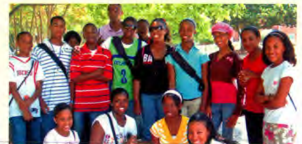
Teen campers enjoyed youth workshops, worship services, olympics, and social activities.