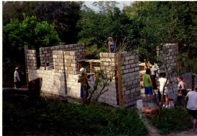
The students built and helped remodel five churches; held evangelistic meetings; visited schools, prisons, and orphanages; and worked in medical clinics during the eleven-day mission trip to Mexico.