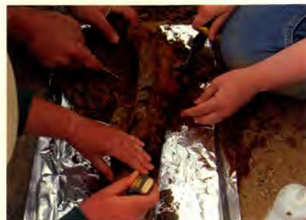
Participants prepare a large bone for transport to Southwestern Adventist University, where it will be identified, cleaned, and cataloged.