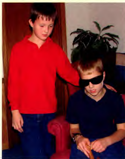
Students portray a blind child telling an American boy about his life.

Young actors from Murphy Adventist Christian School performed the play "Would You Trade?," in which a series of visitors teach an American family of children that they have so much to be thankful for. Visiting their home was a girl from India, a grandma from a nursing home, a blind boy, Pilgrims