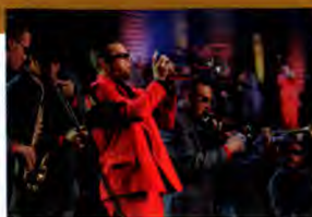
Denver & the Mile High Orchestra