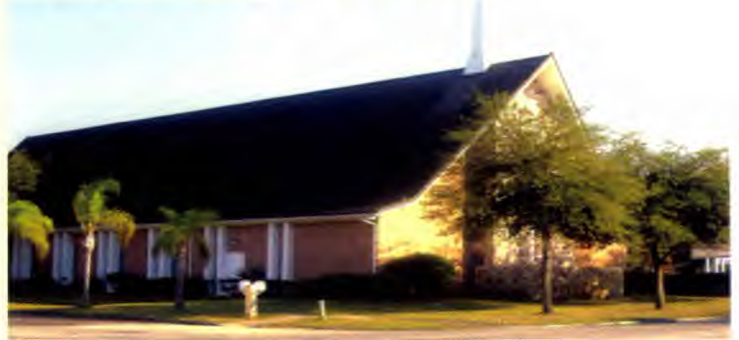
The $3.7 million, 60,000-square-foot, multipurpose facility includes a school and gymnasium.

took place after the ceremony. The facility features a full-size regulation gymnasium, which includes an electronic score board, stage, kitchen, and dressing rooms with showers.