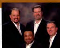
The King's Heralds Quartet