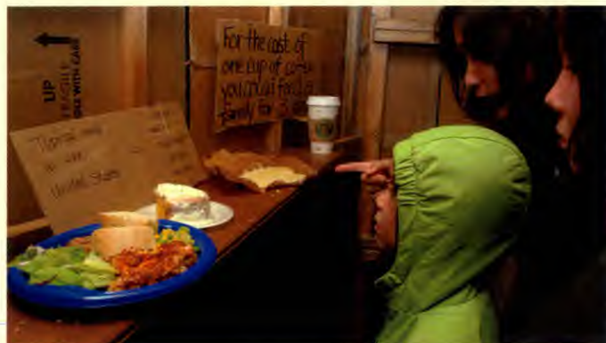
Visitors to the IDP camp were able to see the drastic difference between a typical American meal and a typical Ugandan meal.