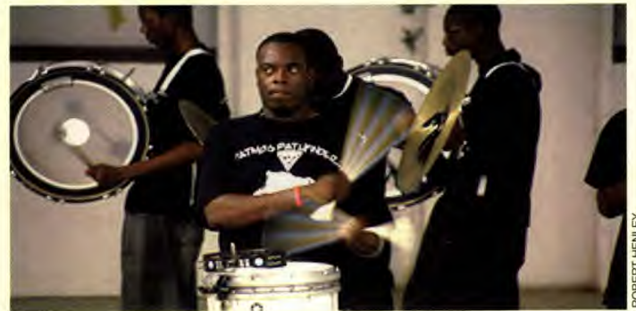
The Patmos Chapel drum corps performs during the drill competition.

Ranzolin's love-filled message for the Pathfinders