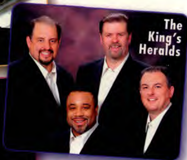
The King's Heralds