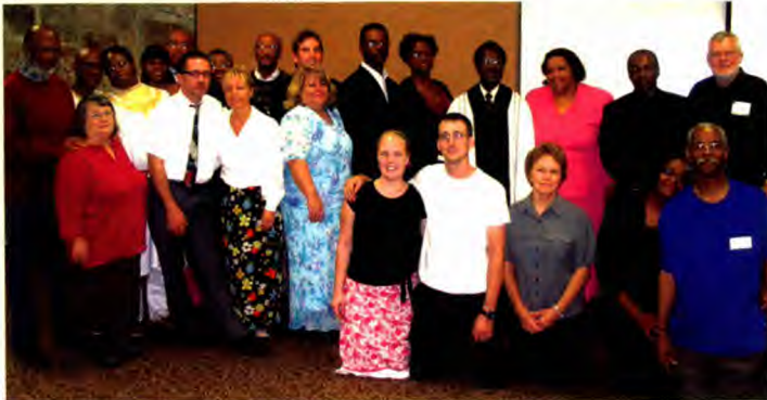
Couples from throughout the Conference enhanced their marriages at the first marriage enrichment retreat held in several years.