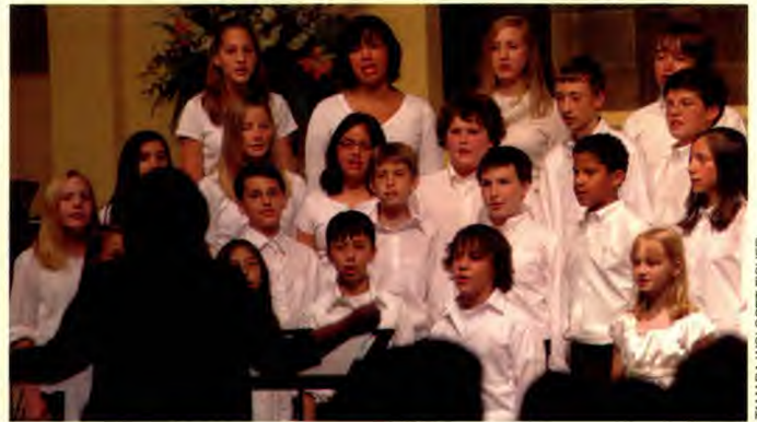
Coble Elementary students share their talents at the evening performance.