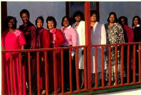
Members of Maranatha's women's ministries team

In an effort to expand their ministries, South Atlantic's women's ministries team for the state of Georgia sponsored a benefit concert for the renovation project of the Maranatha Women's Shelter. The theme for the evening was "A Shelter in the Time of Storm," which was befitting