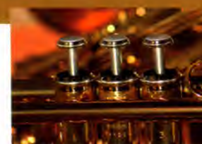
The Sanctuary Brass