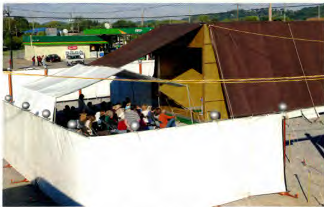
More than 11,000 people visited the Messiah's Mansion during the 10 days it was in Chattanooga, Tennessee.

More than 11,000 people visited Messiah's Mansion in 10 days. More than 1,300 people requested further information about the Seventh-day Adventist Church.