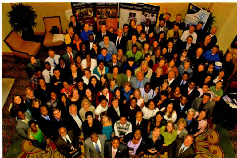
SAC 2008 attendees in Denver, Colorado

I have been a member of the Society of Adventist Communicators for