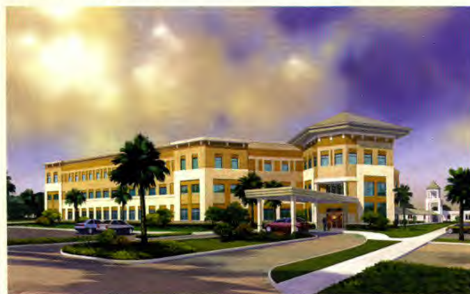
A rendering of the new medical office and outpatient service building

The three-story, 85,000-square-foot outpatient building is scheduled for completion by fall 2009. It will house specialist physician offices, a new imaging services