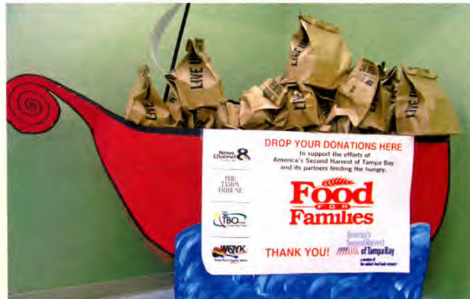
The brand-new Publix supermarket in Sebring decorated its collection container as a Thanksgiving-themed Mayflower boat.