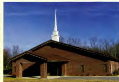
Pictured are the old Pageland church and the new church facility.