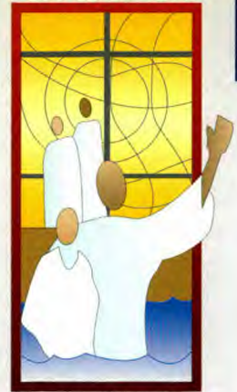
Each One Reach One SOUTHERN UNION