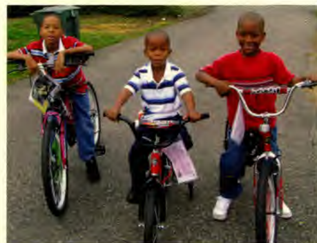
Three boys try their bikes outside.

Strangers heard about the tree and donated gifts. So much was given that gifts were distributed to people who had not signed up. An anonymous donor