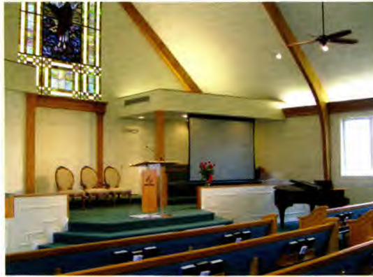
The doors opened on a brighter, more modern facility with a warm and welcoming atmosphere.

The members of Roebuck Church are pleased with the outcome of the project, but are not planning on sitting back and basking in the beauty of their accomplishments. The members stressed that the church and members may look the same on the outside, but they have been changed both physically and spiritually on the inside.