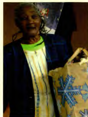
Both the young and the elderly were given gifts.