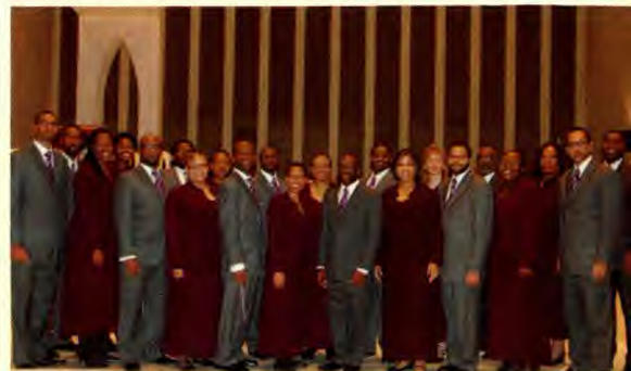
Atlanta's chorale, New Creation, is captured in a photo at the National Presbyterian Church.

Years earlier, at the 2004 democratic presidential