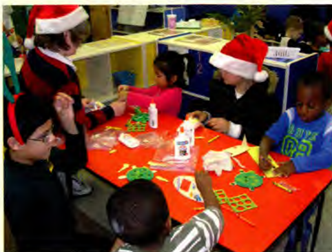
Students from Ridgetop Adventist Elementary School help Head Start children assemble crafts the students brought.

or girl? Can we fit all of them in the cars? Are the snacks and crafts ready to go? Do you know how to get there?" These were a few of the questions heard while preparing to leave.