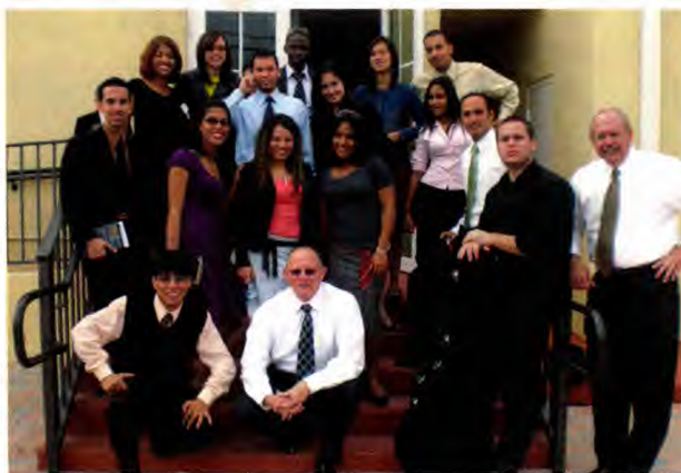
Students and leaders participated in the Miami, Florida, winter MagaBook program.

"That first day, I realized that people can be really mean, and that I was really scared to do this work. In the following days, I was getting a little better at the task, but I was still scared to death, especially at the beginning of every day. But something happened those first days. Looking randomly through the Bible, I found myself reading Ezekiel's calling in Ezekiel 2 and 3. The Word of God was powerful and it could be applied exactly to my situation. It showed me