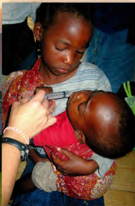
A caring sister brought her dehydrated baby brother to the clinic for medical attention.