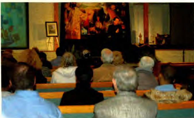
More than 115 individuals filled the Roebuck Church pews during the opening night of Adventures in Prophecy meetings.

The Tupelo, Miss., Church held the first evangelistic meeting in