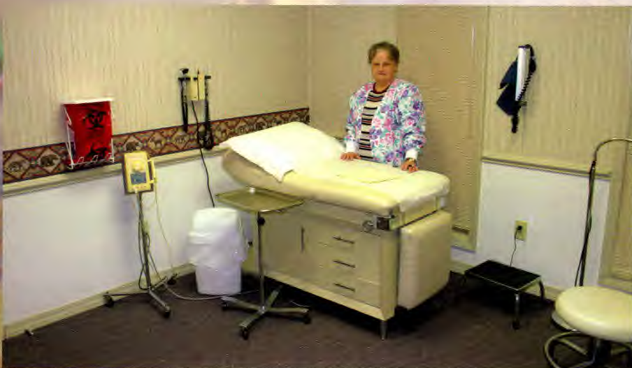
Clinic treatment room

into a mystical form of religion racing off in many different directions. They are not aware of the many similarities their ancestors held with the children of Israel.