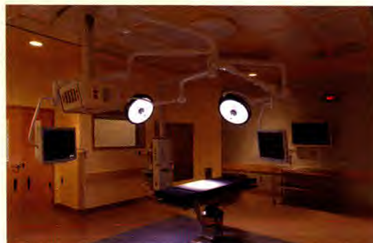
The new surgical suite is designed for advanced surgical innovations, including robotic surgery.

“The new surgical suite provides a location in Seminole County where patients can come for the best surgical