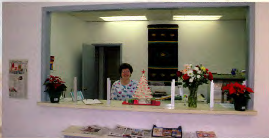
Clinic reception window