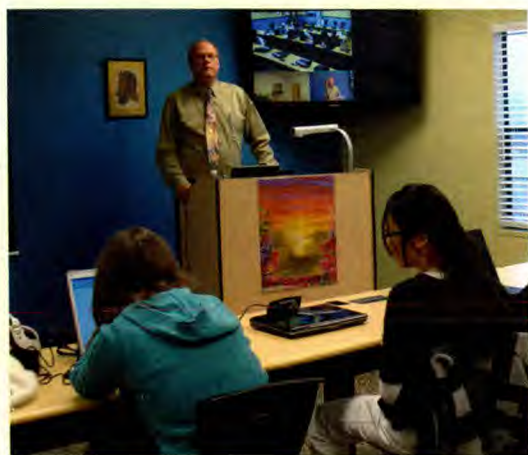
Students learn about the new AAA Marietta campus.