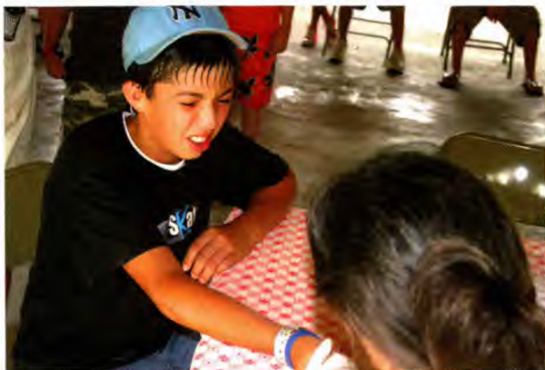
Youth are given glucose tests during camp sessions.