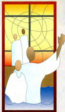
Each One Reach One SOUTHERN UNION