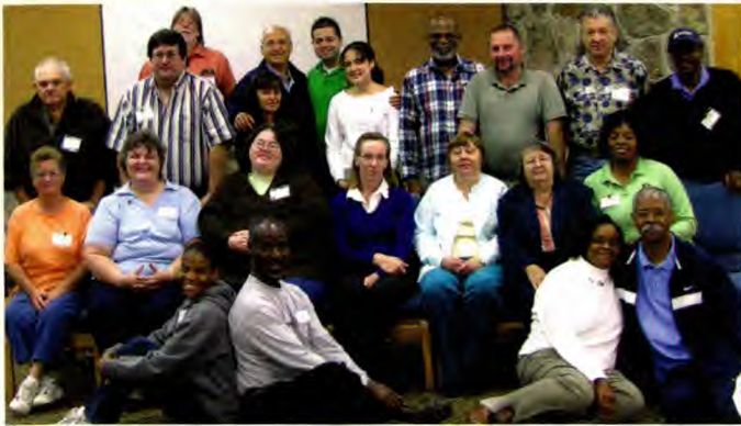
Gulf States couples assembled for a group photo during the Conference's second annual Marriage Enrichment Weekend.