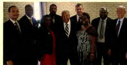
Members of the Sabbath in Africa study group