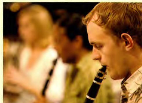
Orchestra members practice for a performance.