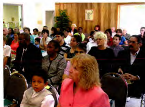
Sabbath services are held in the clinic waiting room.

Native Americans Ministries decided to plant a church in connection with the clinic. The church meets in the waiting room of the clinic each Sabbath. When the church first opened, we would have three or sometimes four people in attendance. Today, there are 30 to 45 people attending the Sabbath service. This little congregation has become a very missionary-minded church. The church has a Pathfinder Club, conducts a nursing home ministry, conducts evangelistic meetings in the waiting room, has