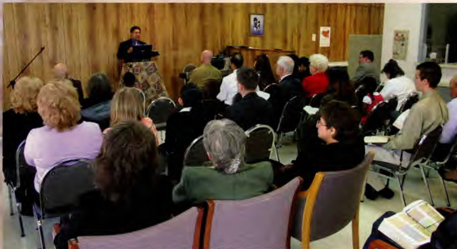
Evangelistic meetings are held in the clinic waiting room.