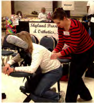
A participant in the health fair receives a free massage.

Utilizing medical professionals from Park