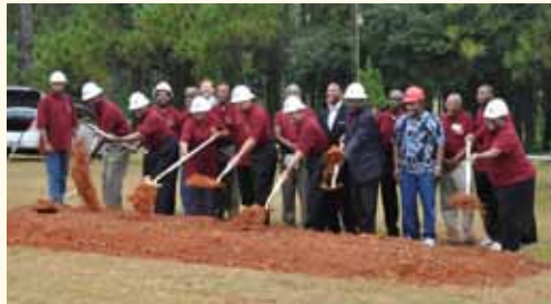
Shouts of joy were heard throughout the crowd as Conference officials, committee members, and Conference constituent representatives turned the earth at the site of the new campground housing.

The light rain could not dampen the spirits of the attendees who had long awaited this event.