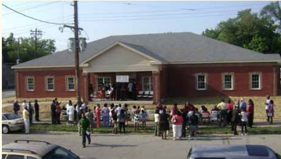
The crowd begins to gather outside of Emma L. Minnis Junior Academy.