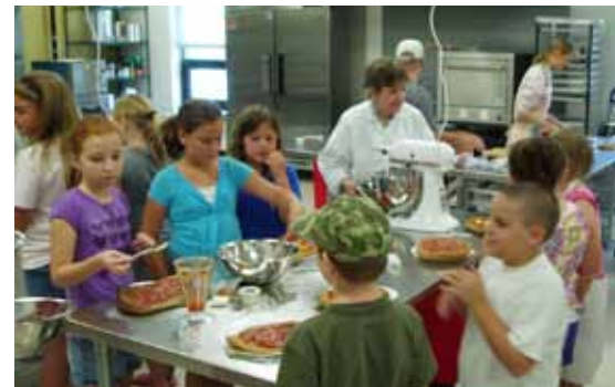
Grade school children enjoyed the Kids Cooking Kollege.

To learn more about this ministry, go to www.discoveringhistroasures.com .