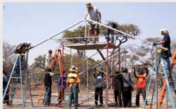
Team members work alongside the locals to put up the framework of a church.