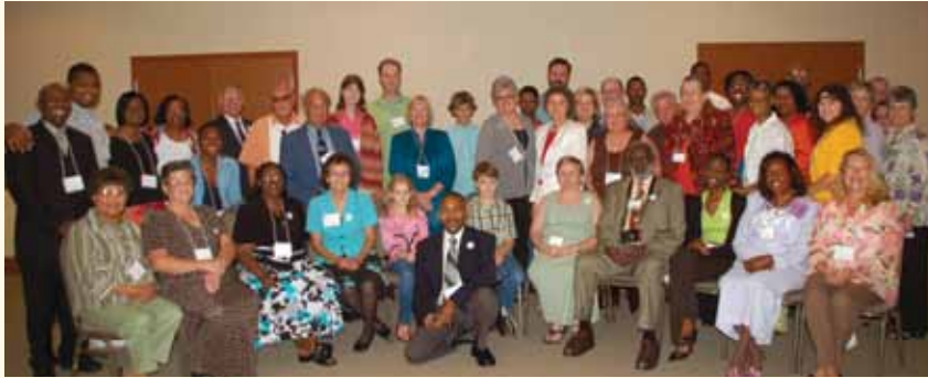
A few of the hundred-plus people who enjoyed the prayer summit held in Birmingham