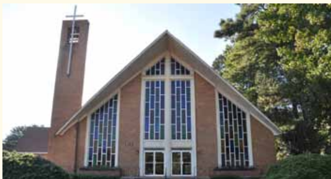
The former church facility will be the home of Atlanta-Berean’s community outreach ministry. The members were blessed to reacquire the facility for half the amount for which it was sold 10 years ago.

This facility will now serve as the Berean Outreach Ministry Center, and