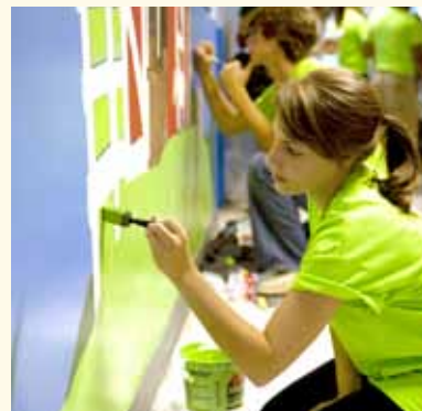
Freshmen get introduced to Southern’s service-oriented culture while painting a mural at the Children’s Home/Chambliss Shelter in Chattanooga.