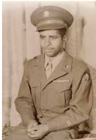
Smith's Army photo

"I could hear men screaming and bullets ricocheting off the build-