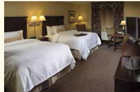
Pictured is an example of the interior for 60 of the 80 rooms that will be constructed. Twenty rooms will have two bunk-beds for use by youth campers and those who desire dormitory style quarters.