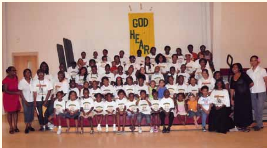
Children, staff, and parents attended the prayer summit.