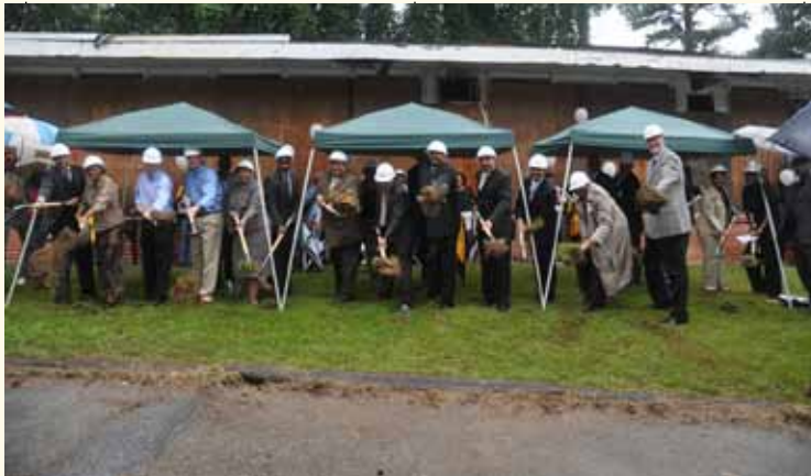
Atlanta-Berean’s pastoral staff was joined by building committee and church members, Conference and Southern Union officials, along with HUD representatives, architects, and civic leaders in the groundbreaking ceremony.

The Berean Village Project was facilitated through an application submitted by Atlanta-Berean Church to the United States Department of Housing and Urban Development (HUD) in