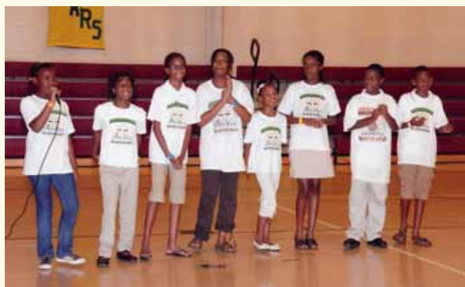
The prayer summit was interactive to give the children an opportunity to demonstrate what they were learning.