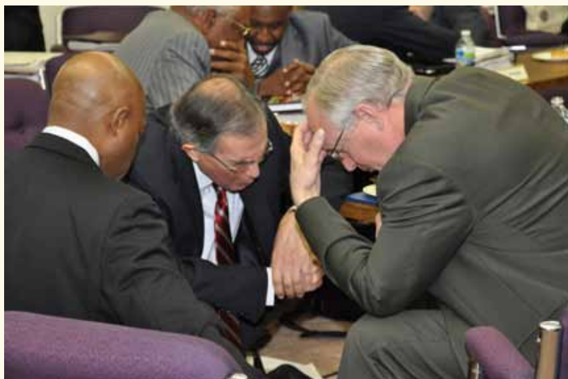
Board members pause to pray for the Oakwood presidential decision.