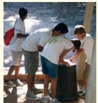
The Bible was the ultimate search tool for the answers to the Sabbath afternoon quiz.