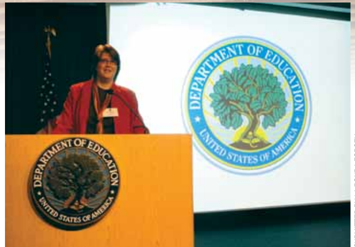
SUBMITTED BY LA RONDA FORSEY

This system allows for lowered commute times in a large city and for students to have another choice when it comes to their education. Students more than 45 minutes from an Adventist day academy traditionally have had to choose between boarding school and public school. While boarding schools are a valuable and appropriate choice for some students, some parents and students have stronger reasons for keeping their students at home longer than others, but don’t wish to sacrifice the atmosphere and excellence that comes with Adventist education.