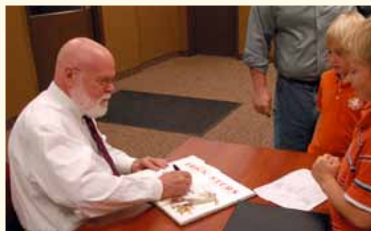
In addition to illustrating the Pennroyal Caxton Bible , Barry Moser has illustrated several children's books like A Ring of Tricksters .

and the Whale," and "Esther" were unveiled at the John C. Williams Art Gallery, while "Simeon," "The Dove," and other New Testament illustrations were revealed in the McKee