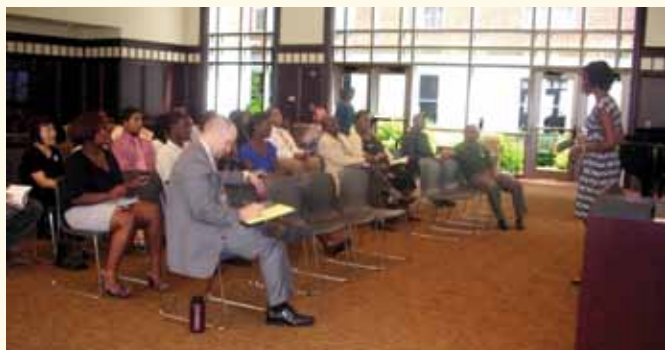
SUBMITTED BY VALERIE BLYDEN