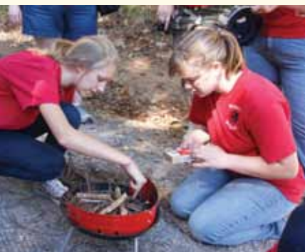
Preparation is important in many activities, especially fire building.