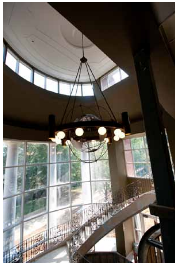
The world-field light fixture hangs over a dramatic staircase located at the very front of the building.

In Florida Hospital Hall, the simulators will range from the most basic to the most advanced nursing course. The two simulation rooms, plus a third space prepared for an extra station, will allow the nursing program to have simulators not only for the associate’s degree program, but also for the bachelor’s and master’s curriculums for the first time.