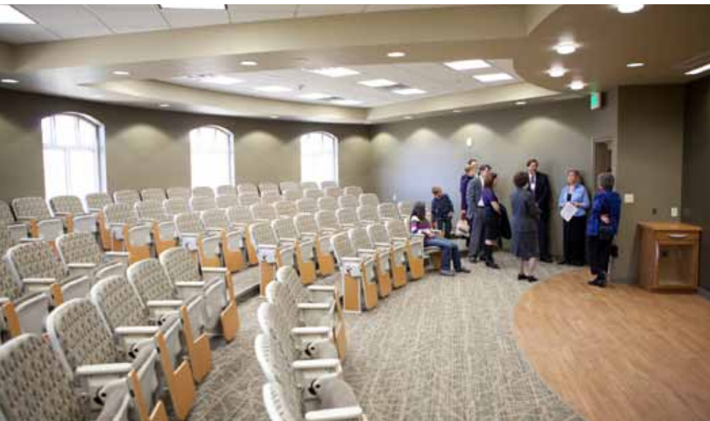
Alumni learn about the features of the new nursing building while standing in one of its classrooms.