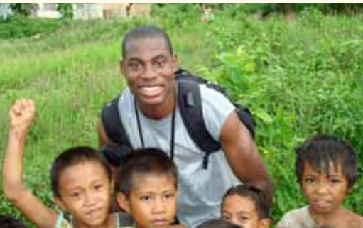
SUBMITTED BY LEROY ABRAHAMS