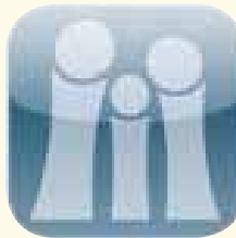
Madison Campus App Icon