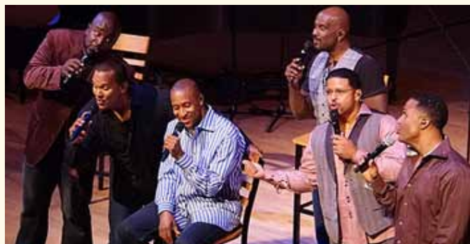
Multiple Grammy Award winning gospel A cappella group, Take 6, performed a benefit concert at Mt. Pisgah Church on October 30, 2010: Alvin Cbea (left), David Thomas, Cedric Dent, Claude McKnight III, Mark Kibble, and Joey Kibble.

According to the National Centers for Injury