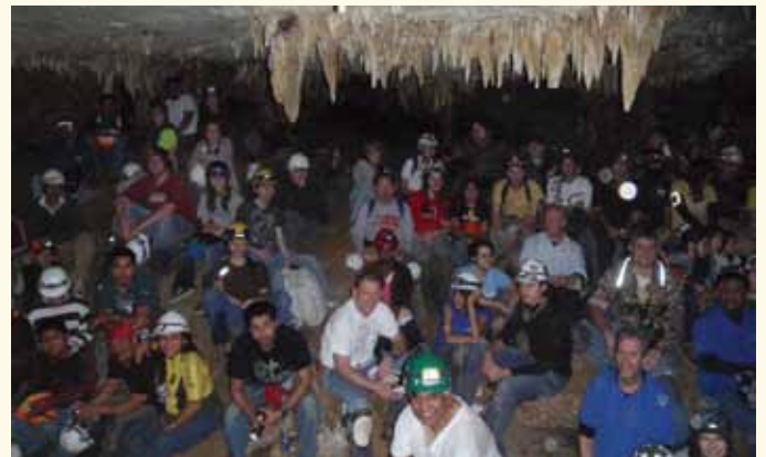
Teens and staff traveled from throughout the Conference to enjoy spelunking with their peers.

After driving to Tumbling Rocks Cave, located near Scottsboro, Ala., 148 excited spelunkers prepared to enter the six-mile-long cave. A stream flows almost the entire length of the cave, and forms a spring just below the entrance. In the first room, Ante Room, is a large walking passage that crosses over the stream. Care must be taken from the start not to step into the crevasse that crosses the path. Other features of the cave include the Saltpeter