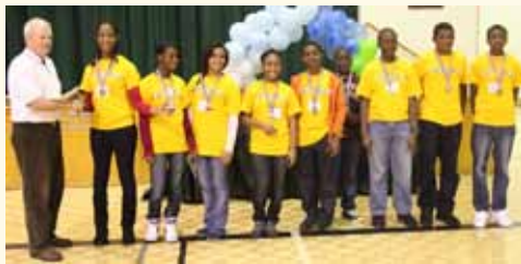
The Miami Union Academy Robotics Team receives their second place trophy during the awards ceremony at the annual Southern Union Robotics Challenge at Southern Adventist University.

in five categories: robot design, robot programming, team work, research presentation, and the robot challenge.