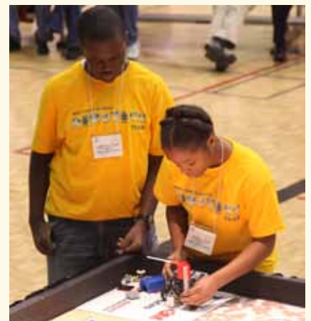
Miami Union Academy Robotics Team members prepare to launch their robotic on a mission during the robot challenge.