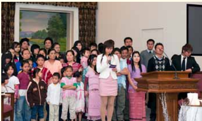
Dressed in their colorful native outfits, the group was invited to the front of the church and officially welcomed.