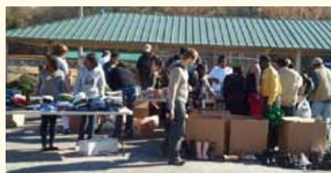
The community outreach initiative had such an impact that the federation leaders are looking to make it an annual event.