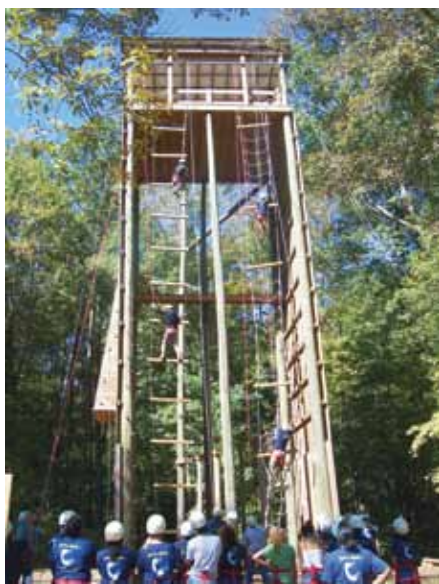
Guests climb rope ladders as part of a team-building activity at the outdoor education center on Southern's campus.