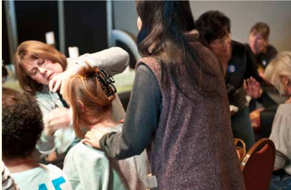
More than 70 women volunteered to serve the Chattanooga, Tenn., community with a “God in Shoes” outreach. Guests were pampered free of charge, offering a spa day with hair styling, manicures, and facials. The event took place the day before the retreat, March 17, 2011.