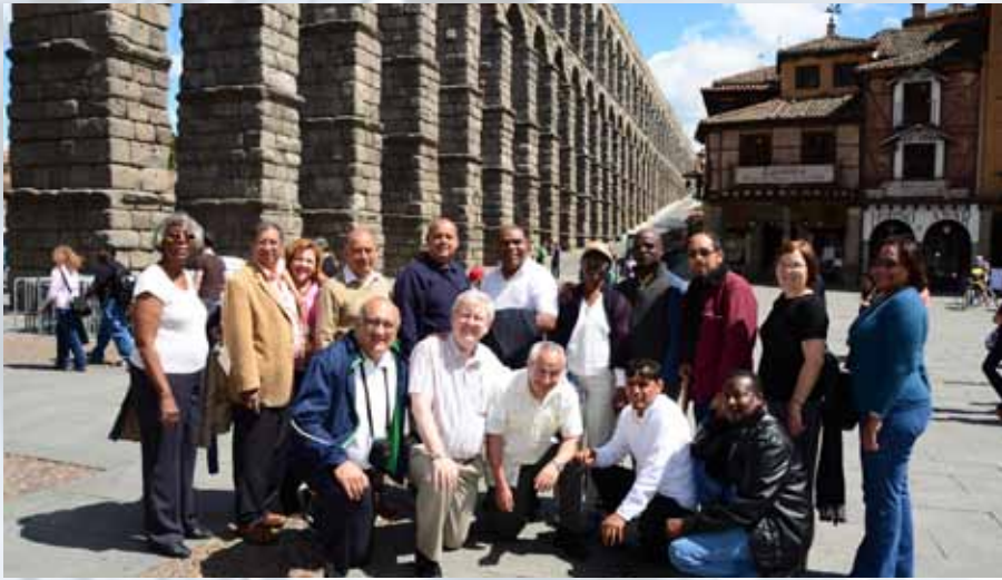
The evangelistic team that preached in 19 cities visited the ancient Roman aqueduct in Segovia, Spain, along with other sites, to gain an overview of the history and culture of Spain before going to the cities where God used them to baptize more than 84 individuals.