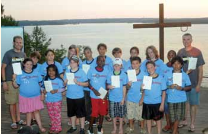
These 19 junior campers were baptized at Camp Alamisco, as parents, friends, and staff watched from the shores of Lake Martin.