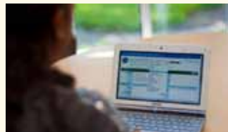
Five new databases in the R.A. Williams Library are helping students stay on the cutting edge of professional literature in their fields.

Two new resources in the R.A. Williams Library are helping students with research and memorization. The first, a set of 25 anatomical models, increased the size of the existing collection by nearly a quarter, providing students with more opportunities to study outside of the classroom.