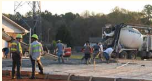
Loganville Church sanctuary foundation being poured. The church celebrated the opening of this new sanctuary on August 20, 2011.

After much prayer, hard work, and financial sacrifice, the Loganville, Ga., Church held the official consecration program for