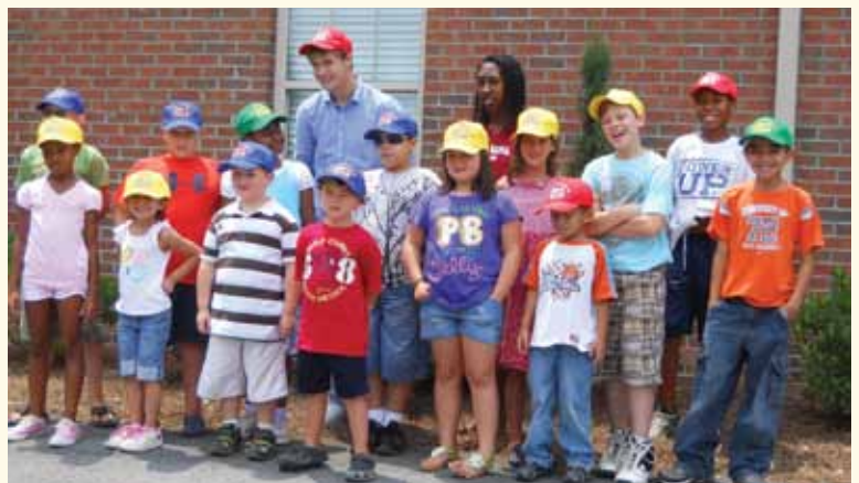
The Vacation Bible School "fishing team." More than half of the children who attended were from the community.