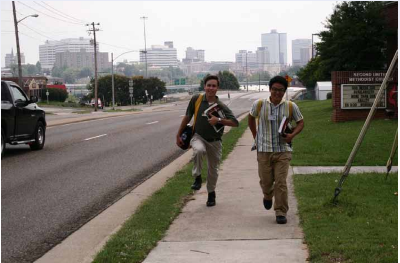
LE's blaze the trails in Atlanta, Georgia, with books.