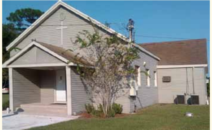
First Coast International Church sits on 1.5 acres, and is located in the Arlington Community of Jacksonville, Fla.

Arlington is known as "Sin City" to many people