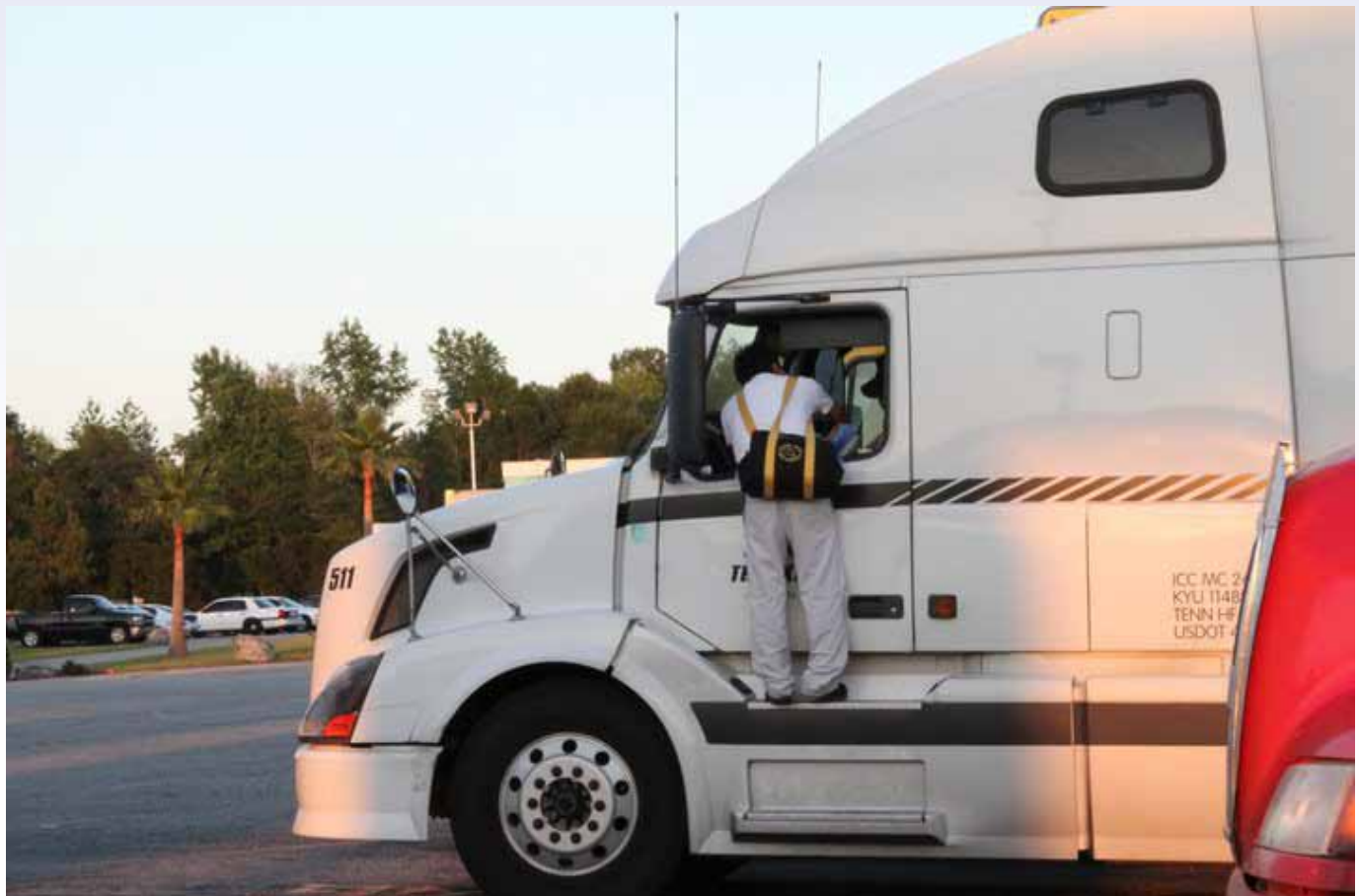
This brave student LE canvasses a truck driver before he drives away.