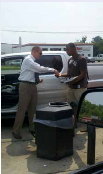
An LE canvasses a man next to his truck.