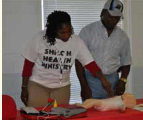
One of the volunteers conducting a CPR class demonstrates on an infant mannequin.