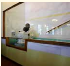
Mt. Gilead Church dedicates new baptistry.

Nestled close to downtown Bradenton, Fla., is the home of Mt. Gilead Church.