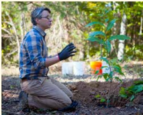
For the land dedication event, Southern partnered with a national conservation group in the planting of two American chestnut trees, a formerly abundant species which struggled in the last century but is making a comeback.

Southern Adventist University’s large, rural campus in Collegedale