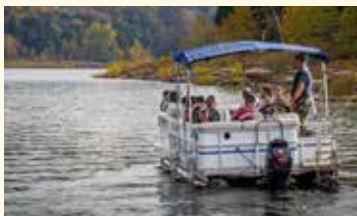
The men enjoy a ride and the beautiful surroundings at Center Hill Lake.

For the second year in a row, the Lord blessed with stunningly beautiful fall weather as the men of the Kentucky-Tennessee and South Central conferences gathered at Indian Creek Camp in Liberty, Tenn., October 24-26, for a joint Men’s Ministries Conference. Approximately 75 men were in attendance from Alabama, Georgia, Indiana, Kentucky, Mississippi, Ohio, and Tennessee.