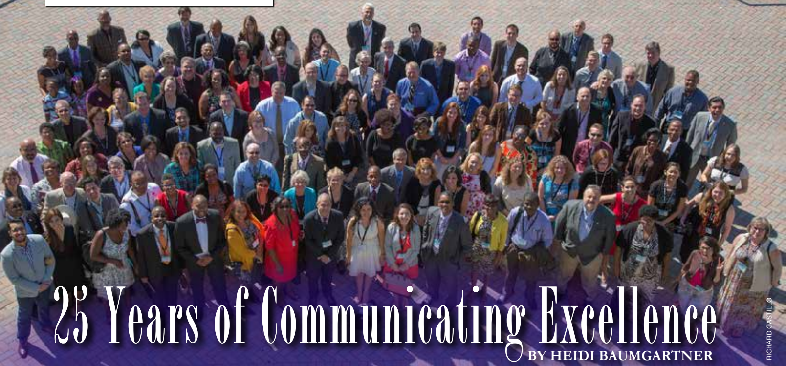
Pictured are attendees of the 25th anniversary celebration of the Society of Adventist Communicators in Jacksonville, Florida, October 16-18, 2014.

If you surveyed Adventist communicators in the last 25 years, they would tell you the city of their first time attending the Society of Adventist Communicators (SAC) convention. Some might say Orlando, Florida; Huntsville, Alabama; Ontario, California; Nashville, Tennessee; Rochester, New York; Denver, Colorado; Dallas, Texas; Albuquerque, New Mexico; or many other locations across the country.