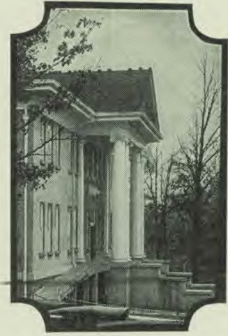
"THE GATEWAY TO SERVICE"