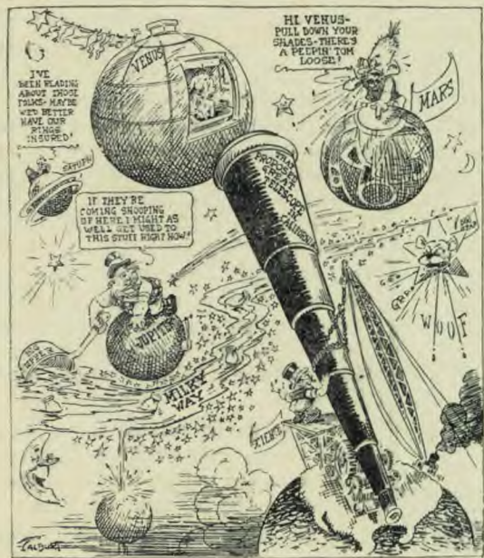
From the "Washington Post"

This cartoon from the "Washington Post" shows the surprise that our neighbor-planets will exhibit when the California Institute of Technology erects its proposed telescope which will be twice as large as the largest one in existence today. It will enable astronomers to see distant objects four times as well as with their present equipment, which will be as much as a billion light years away.