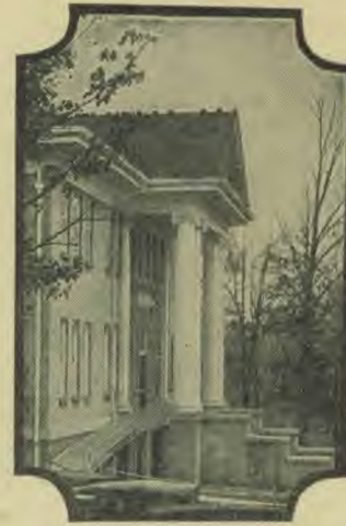
"THE GATEWAY TO SERVICE"