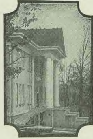
"THE GATEWAY TO SERVICE"