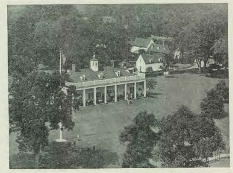
Mount Vernon on the Potomac, the home of America's first President, is a typical Virginia farm of colonial days. The buildings have been restored as nearly as possible to their original condition.

The sale was well patronized by students and friends. Every mother in the Association contributed to the