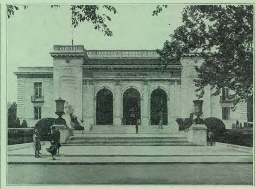
The Pan American Union Building is here overlooking the President's Park on the east and Potomac Park on the south. The building is the home of the International Organization, maintained by twenty-one Latin American Republics.

In closing, the speaker made an urgent appeal that every one be stationed for God, as the day and hour that it is nearing fulfillment.