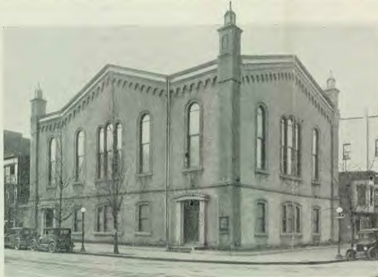
The Capital-Memorial Church, first Seventh-day Adventist Church in Washington, D. C.