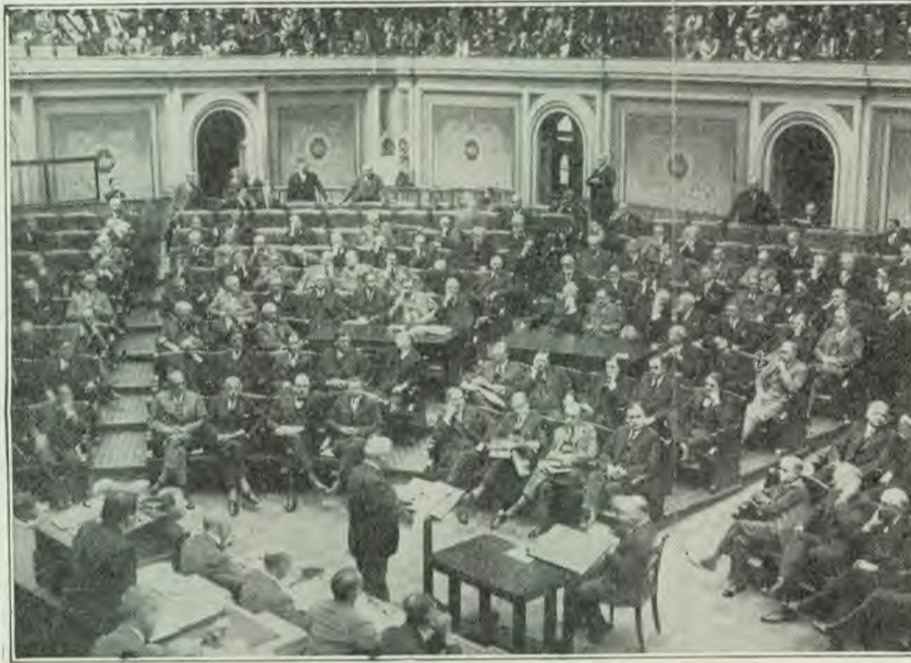
The House of Representatives in Session

Seventeen academic and 39 college students have no grades lower than B, making a total of 146 A's and 160 B's. (See page 3, col. 3)